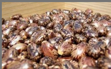
Castor Seed Meal