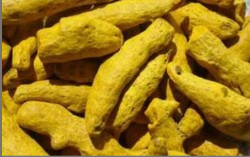
Turmeric Whole And Powder