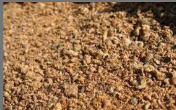
Cotton Seed Meal