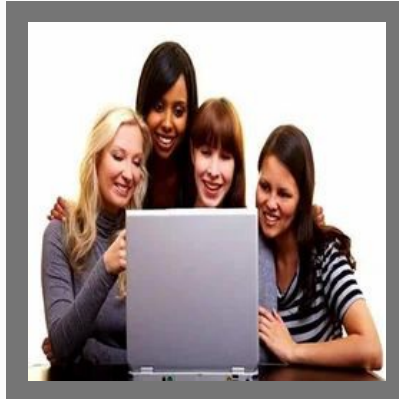
Recruitment for Communication & Advertising Industry