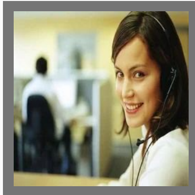
Recruitment for Call Centre & IT Industry