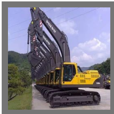
Recruitment for Heavy Equipments & Engineering Industry