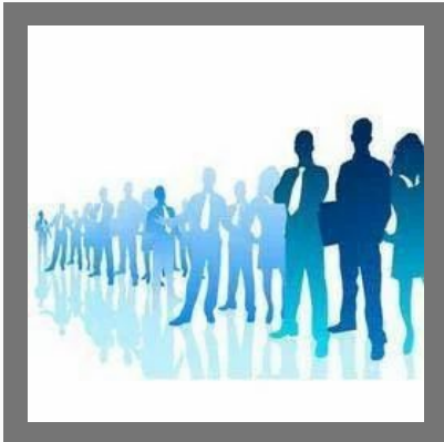
Staff Hiring Solutions