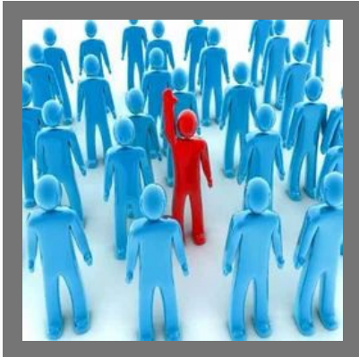
Recruitment for Telecom Industry