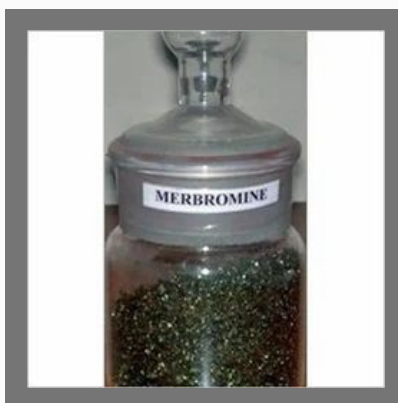
Mercurochrome / Merbromin N.F