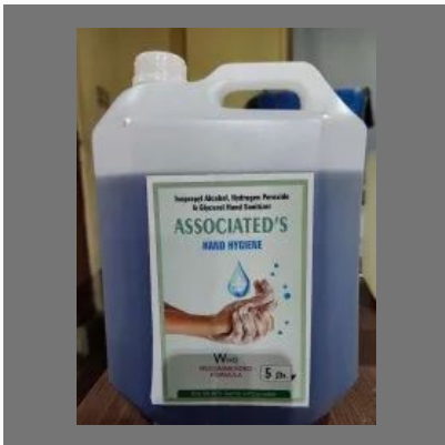
HAND SANITIZER LIQUID AND GEL