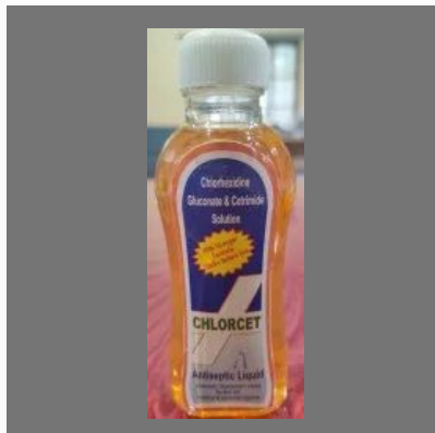
Antiseptic Lotion With Chlorhexidine And Cetrimide