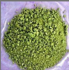
Gentian Violet USP