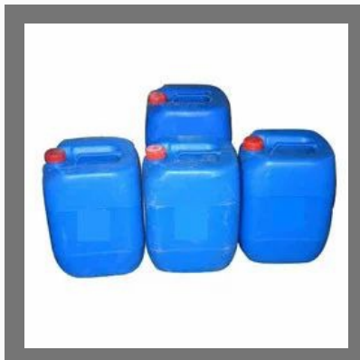
Black Disinfectant Fluid Phenolic Type ( Black Phenyl )