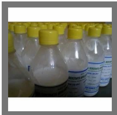
Benzyl Benzoate Application I.P / Lotion