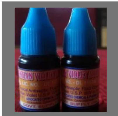
Gentian Violet Solution 1% USP