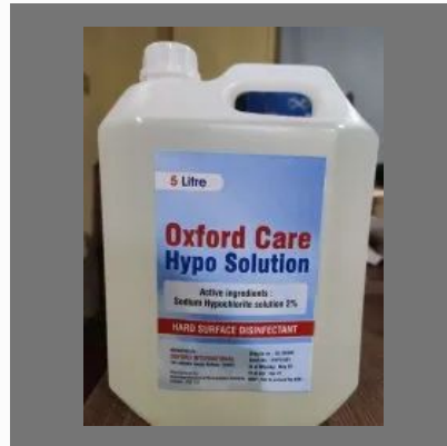
SODIUM HYPOCHLORITE SOLUTION