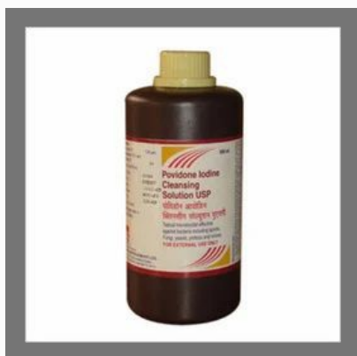
Povidone Iodine Solution