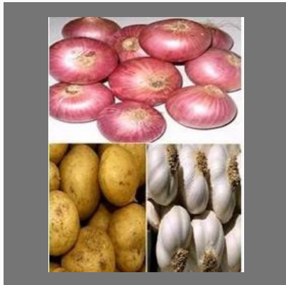
Underground Grown Vegetables