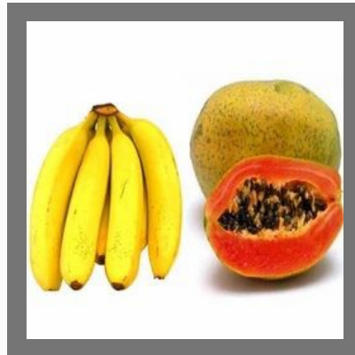
Banana & Papaya