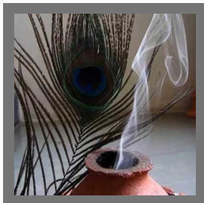
Agarbathi & Computer Sambrani