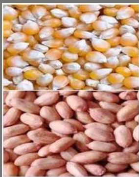
Groundnut & Corn