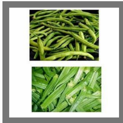
Beans & Ladies Finger