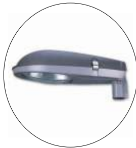
AC 230 V LED Street Lighting System