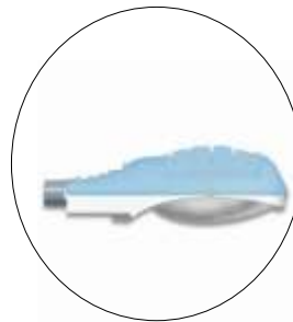
DC 12 V LED Street Lighting System