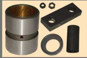
Centre Beam Kit