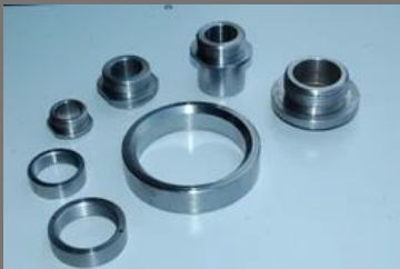
CNC Machined Components