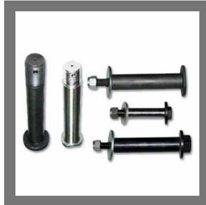
Threaded Pin Type Two