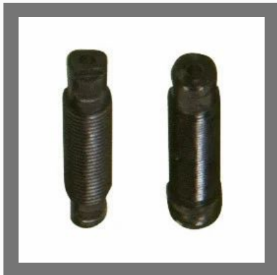
Threaded Pin (Hard)