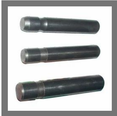
Tooth Lock Pin