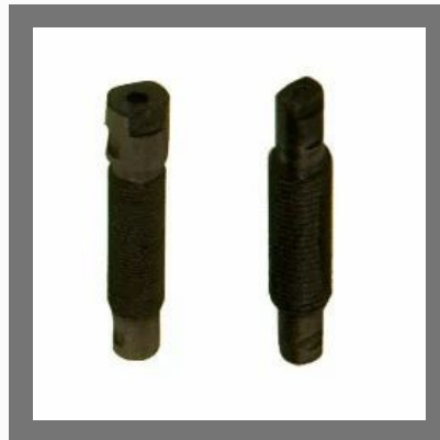
Threaded Pin (Nickel Plated)