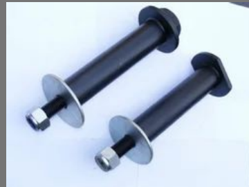
Torque Arm Bolts