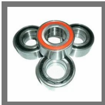
Hub Oil Ring Spacers