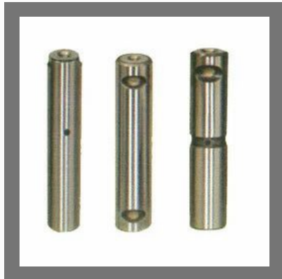
Shackle (Zinc Coated)