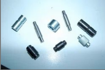
Breake Shoe Rollers