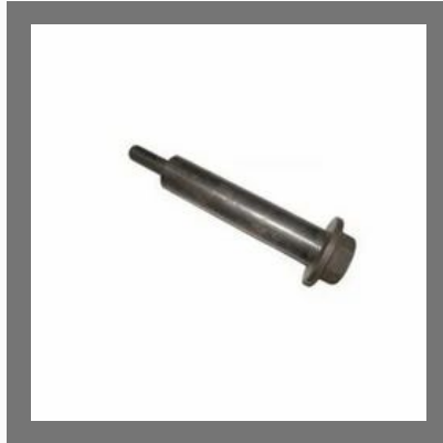
Torque Arm Bolts