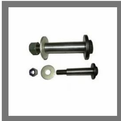
High Tensile Fasteners