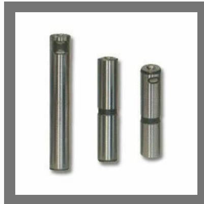
Spring Shackle Pins