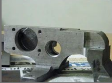
Aluminum Machined Components