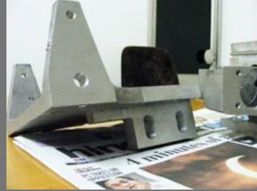
Aluminium Machined Components