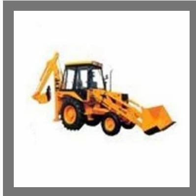
Crane Spare Parts