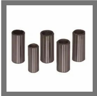
Threaded Bushes (Hollow Cylindrical Style)