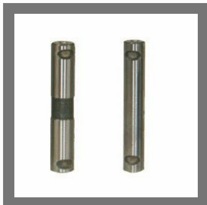
Spring Shackle Pins