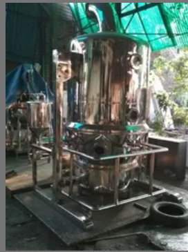
Chemical Plants Machine