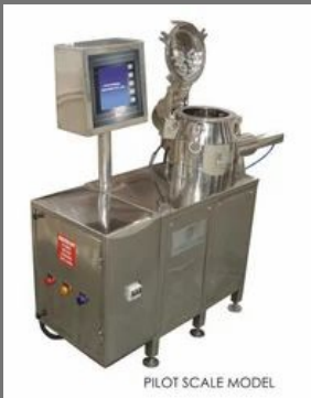
Rapid Mixer Granulator