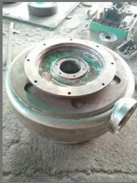
Pharma Machines Base