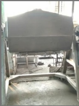
Rapid Mixer Machine