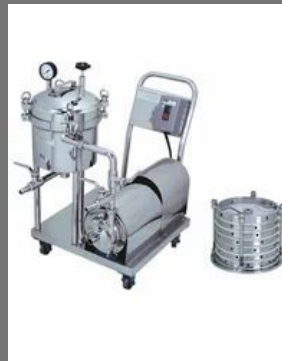
Horizontal Filter Press