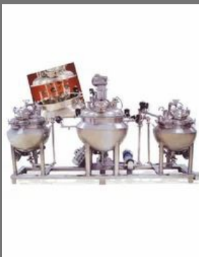
Cream & Ointment Plant