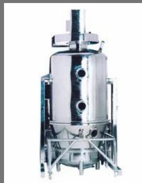
Fluid Bed Dryer