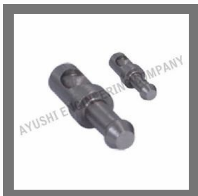
Nip Roller Stud