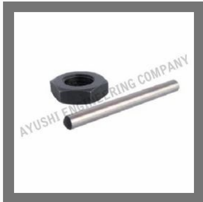
Nut & Locking Pin