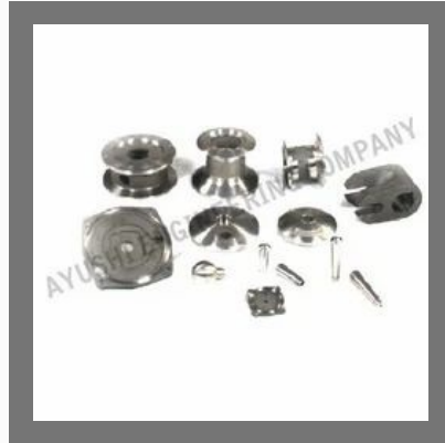
Metal Machined Parts