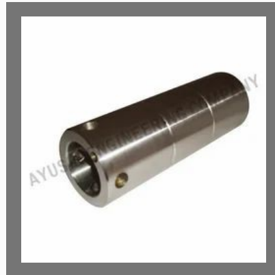
Intermediate Roller Axle