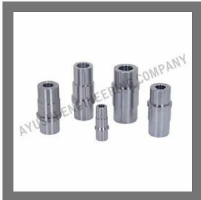
Hollow Slow Speed Shaft