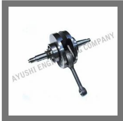
Three Wheeler Four Stroke CNG Crank Shaft