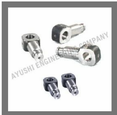
Link Diiferential Lock