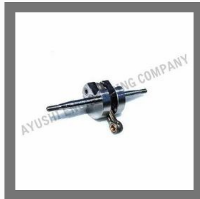
Ralli Crank Shaft