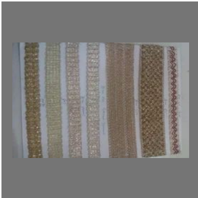
Fancy Zari Lace