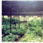
Crop Protective Net