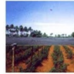
Crop Protective Net