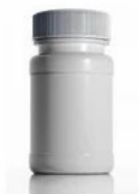
Stress Induced Skin Care Support Capsule