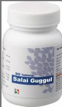
Salai Guggul Medicine