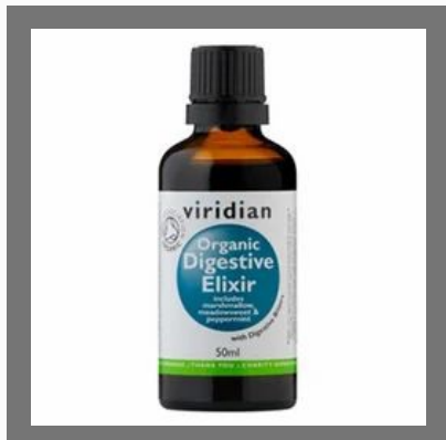
Liver & Digestive Support Elixir