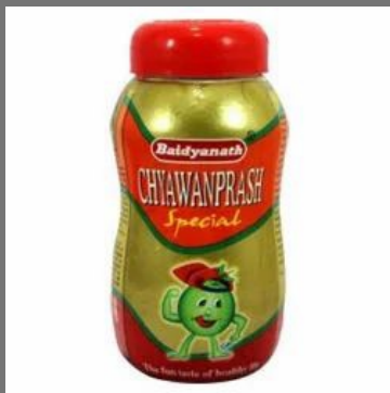
Chyawanprash Chocolate Granules