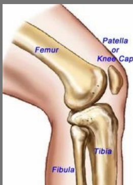
Muscle & Joint Pain Relieving Oil