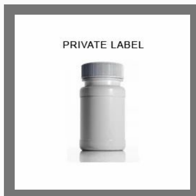
Stress Induced Capsule