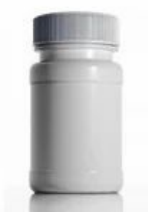
Calcium Supplement Capsule