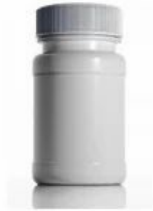
Turmeric Curcumin Capsule