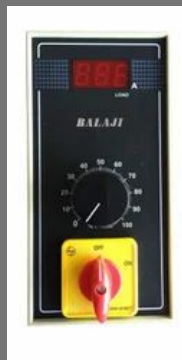
Torque Motor Controller