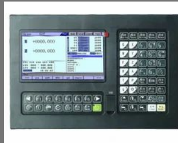
CNC Controller For Bangle Engraving Machine