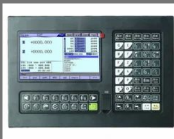
CNC Controller For Spray Machine