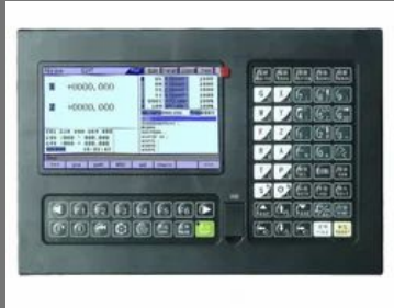
CNC Controller For Lathe Machine