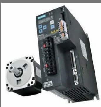
Siemens Servo Motor