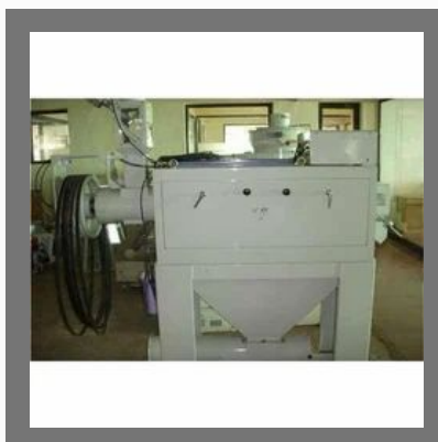
Silky Jet Polisher