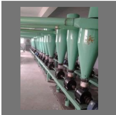
Flour Mill Pneumatic Lift