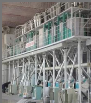
Maize Mill Consultant