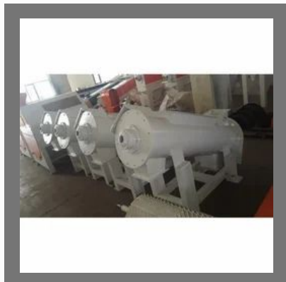
Triple Rotter Damper