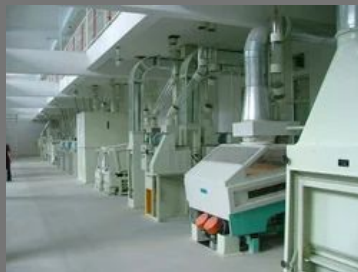
Rice Mill Consultant