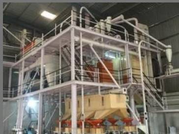
Atta Chakki Consultant