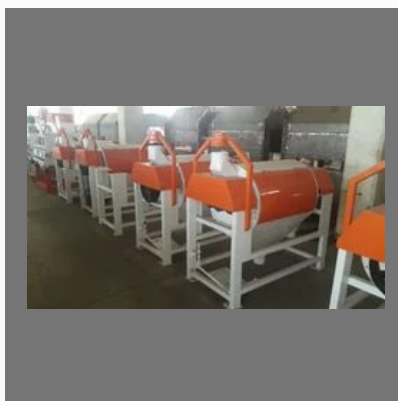
Vibro Bran Finisher