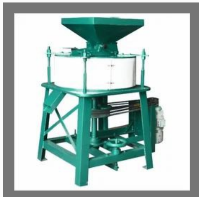
Heavy Duty Chakki