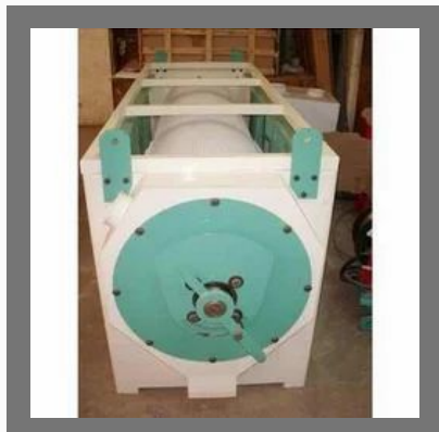
Rice Length Grader