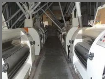
Roller Flour Mill