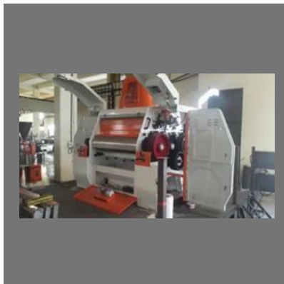
Automatic Roller Mill