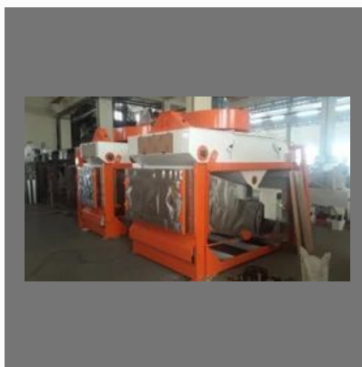
Triple Deck Pre-Cleaner