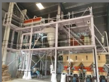
Atta Chakki Plant