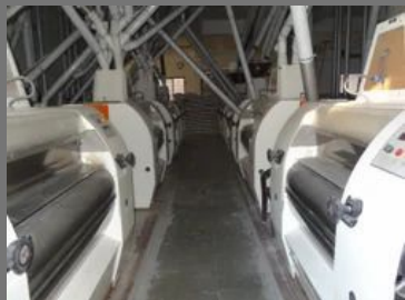
Roller Flour Mill Plant