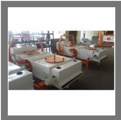
Double Deck Vibro Separator