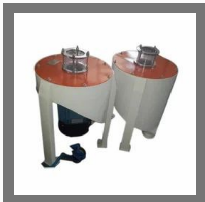
Seed Cleaning Machine