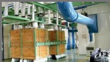
Automatic Flour Mill