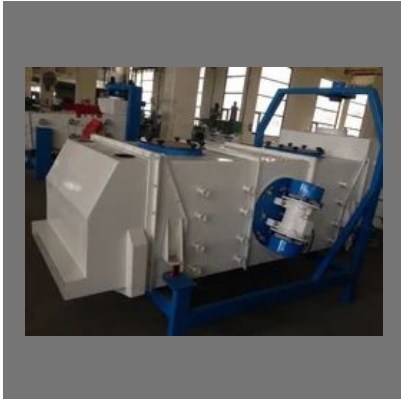
Four Deck Vibro Separator