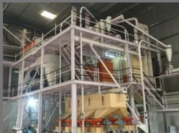
Whole Wheat Atta Plant