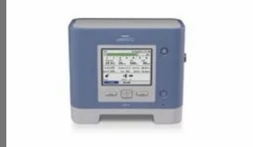
Respironics Trilogy 202 Ventilator