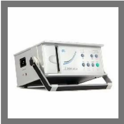
Single Channel ECG Recording Machine