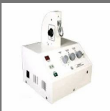
Autotrac Cervical And Lumbar Traction Device