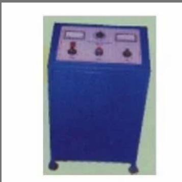
Shortwave Diathermy Machine