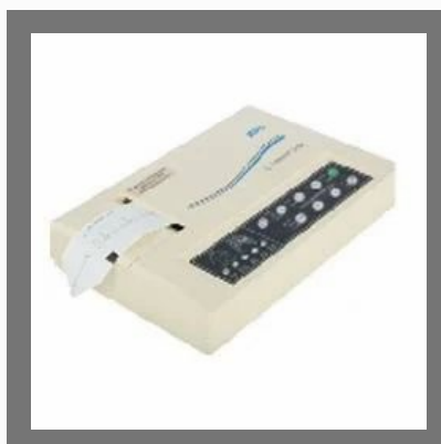
Single Channel ECG Recording Machine