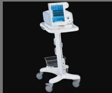
Respironics V60 Non-Invasive Ventilator