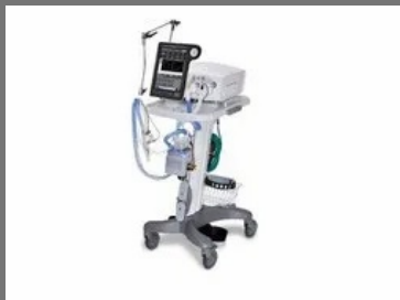
Philips Respironics V680 Critical Care Ventilator