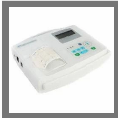
Simultaneous Three Channel ECG Machine