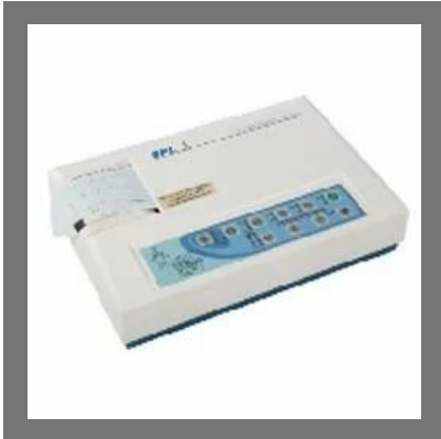
Three Channel ECG Machine