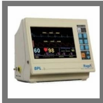
Magna Colored Sign Monitor