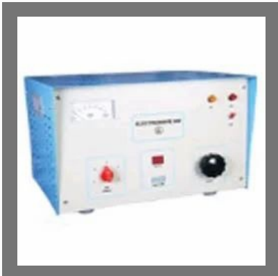
Electrowave Medium Power Shortwave Physiotherapy Equipment