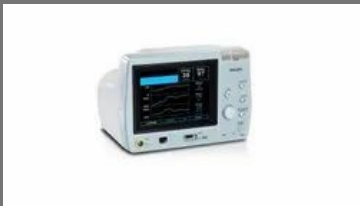
Respironics NM3 Respiratory profile monitor Ventilators