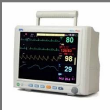
Ultima Prime Multi Sign Monitor