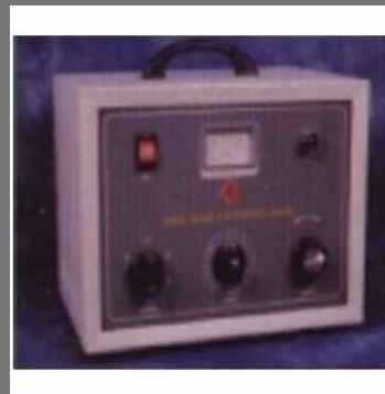
Shortwave Diathermy Equipment