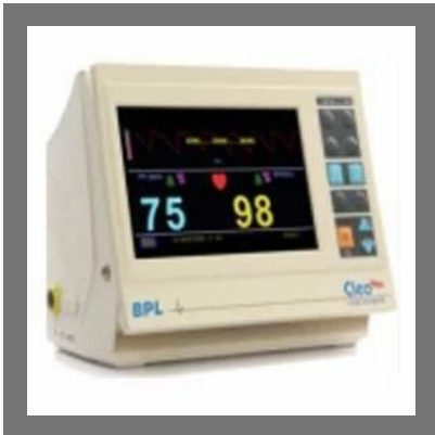
Celo Plus Plane Sign Monitor