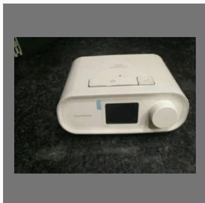
Philips Medical Equipment