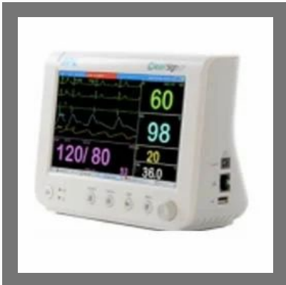
Clear Sign Monitor