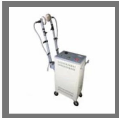
Electrowave High Power Shortwave Diathermy Unit