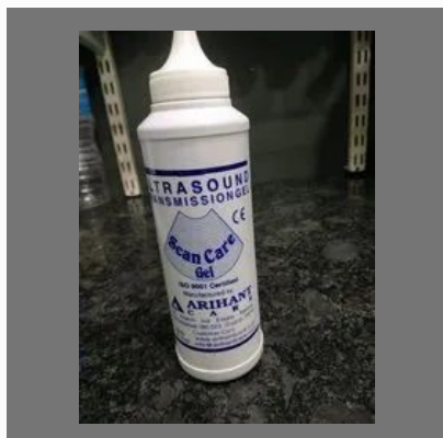
Scan Care Gel