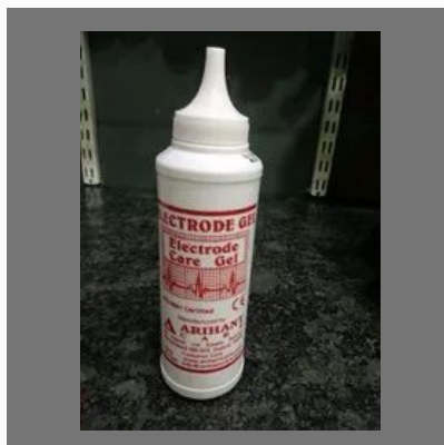
Electrode Care Gel