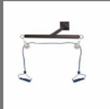
T Pulley With Rope