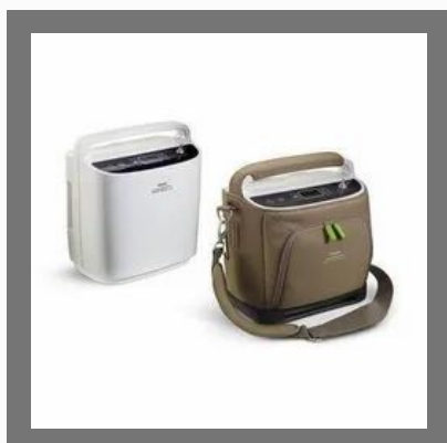
Philips Simplygo Oxygen Concentrator