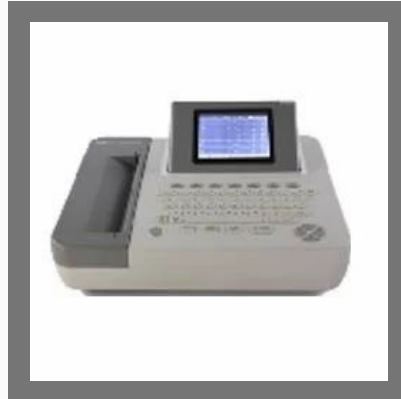
Cardiart Twelve Channel ECG Machine