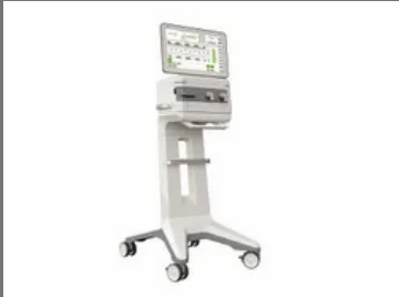
BPL Elisa 600 Medical Ventilator