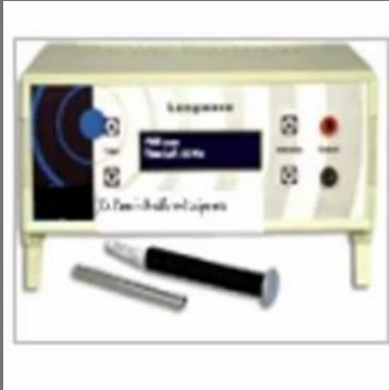
Longwave Diathermy Machine