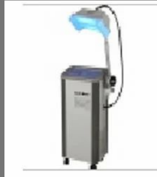
Digital Microwave Diathermy Machine