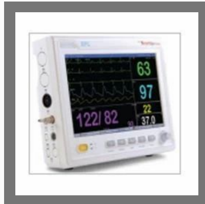
Smart Sign Monitor