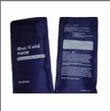
Imported Hot And Cold Pads