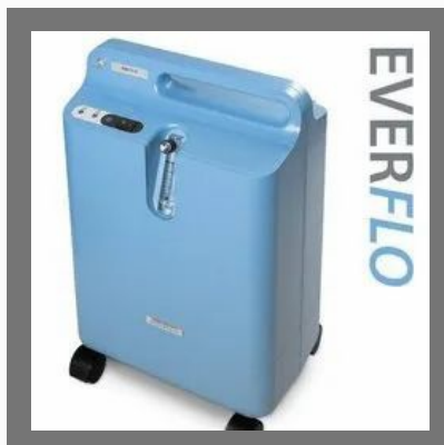
Philips Everflo Oxygen Concentrator 5LPM