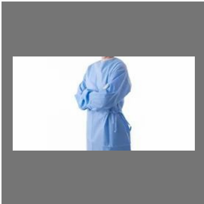
Standard Surgical Gown