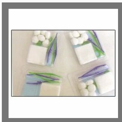
Sterile Dressing Sets