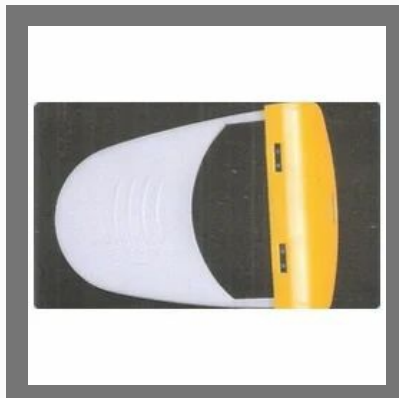
Disposable Skin Blade