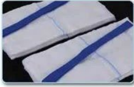
Lap Sponge Or Mopping Pad X-Ray