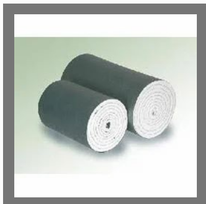
Absorbent Cotton Rolls