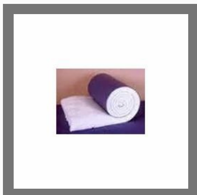
Absorbent Gauze Bandage