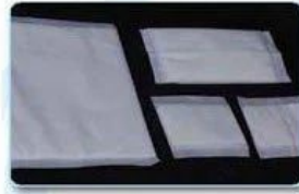
High Absorbent Dressing Pads