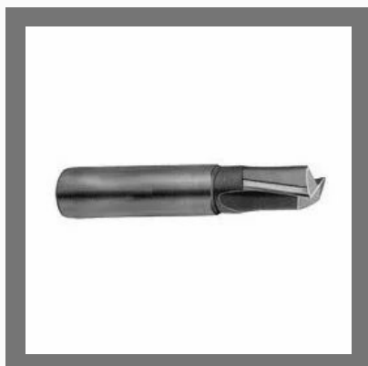
Parallel Shank Slot Drills