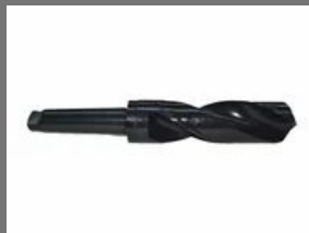
Morse Taper Shank Twist Drills