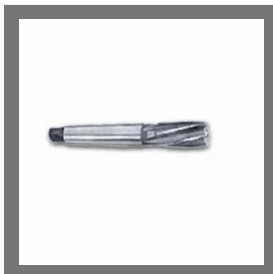
Taper Shank End Mills