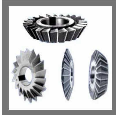
Single / Equal Angle Cutters