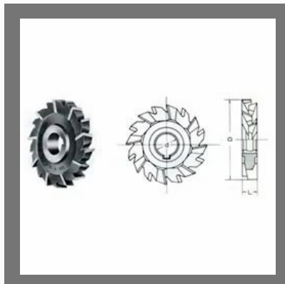
Side & Face Cutters (Staggered Teeth)