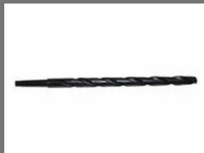
Lengthed Morse Taper Shank Twist