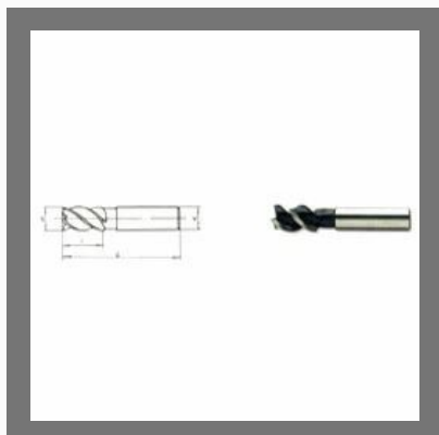
Parallel Shank End Mills