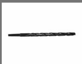
Lengthed Morse Taper Shank Twist