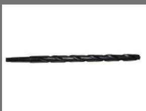
Lengthed Morse Taper Shank Twist