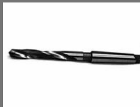
Long Morse Taper Shank Twist Drills