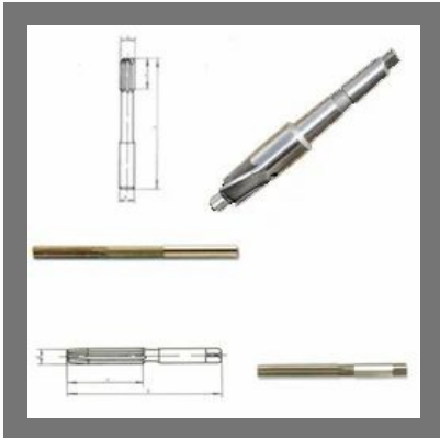
Hand & Machine Reamer