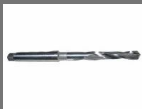
Morse Taper Shank Twist Drills