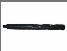
Morse Taper Shank Twist Drills