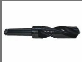
Morse Taper Shank Twist Drills