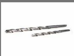
Morse Taper Shank Twist Drills