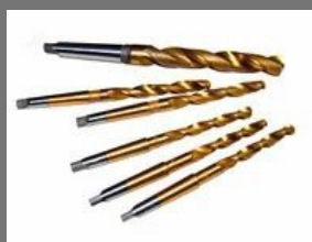
Morse Taper Shank Twist Drills