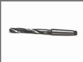
Morse Taper Shank Twist Drills