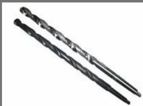
Lengthed Morse Taper Shank Twist