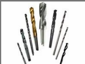
Orse Taper Shank Twist Drills