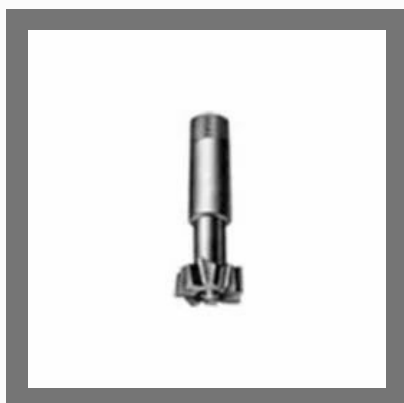
T-slot Cutters With Taper Shank