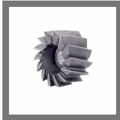
Shell End Mills