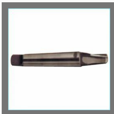
Taper Shank Slot Milling Cutters