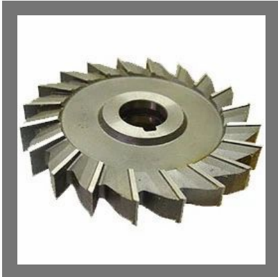
Side & Face Cutters (Straight Teeth)