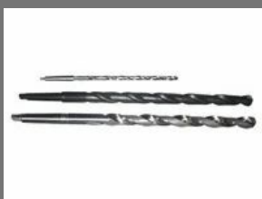
Long Morse Taper Shank Twist Drills