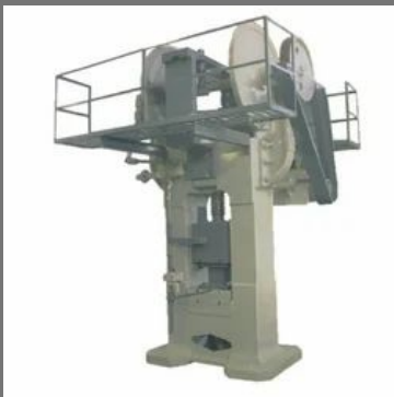
Basant Friction Screw Press downstroke type