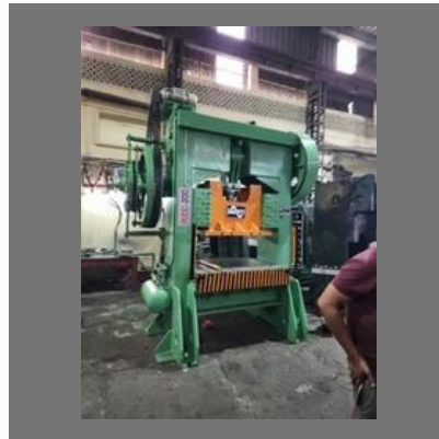
400 Ton H Type Pneumatic Power Press