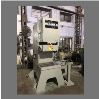
50 Ton C Type Hydraulic Power Press