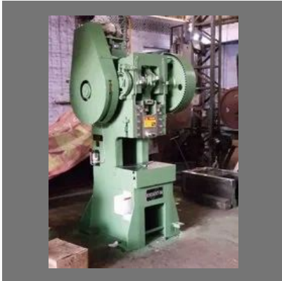
C Frame Power Press