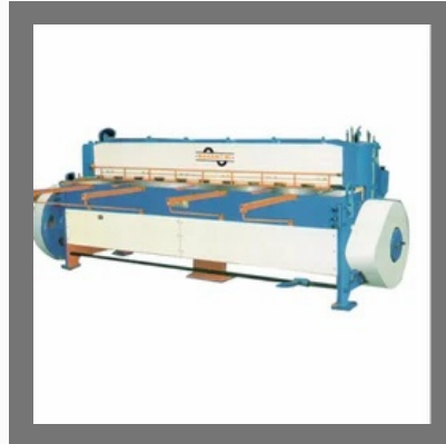
Basant Mechanical Under Crank Shearing Machine