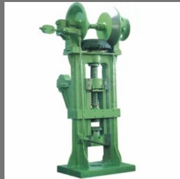
Basant Automatic Forging Press