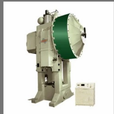
Basant Hot Forging Press