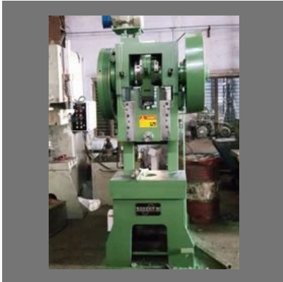
50 Ton C Type Mechanical Power Press