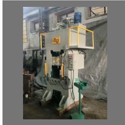
300 Ton Pillar Hydraulic Power Press