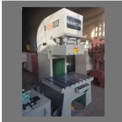
150 Ton C Type Hydraulic Power Press