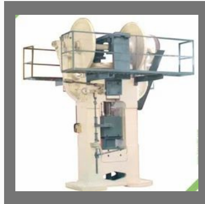
Downstroke Friction Screw Press