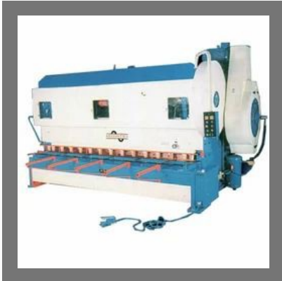
Basant Over Crank Pneumatic Shearing Machine