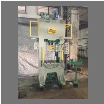
50 Ton H Type Hydraulic Press