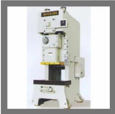
Basant Cross Shaft C Frame Power Press