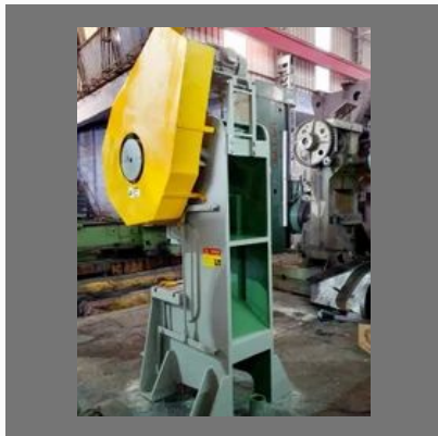
High Speed Power Press