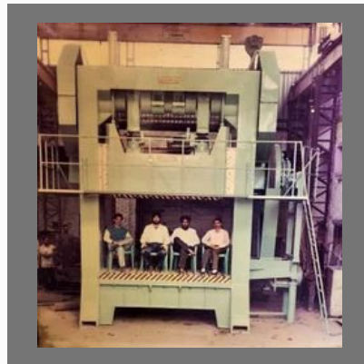
Heavy Duty Power Press