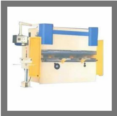
Hydraulic Press Brake