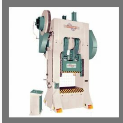
Power Press Machine H Frames Two Point Crank Press