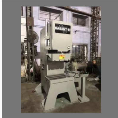
200 Ton C Type Hydraulic Power Press