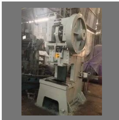
Basant C Frame Power Press