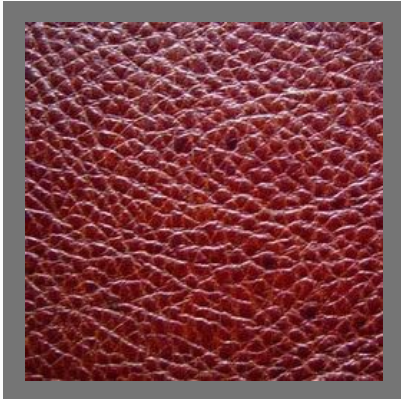
Buffalo Split Barton Printed Leather