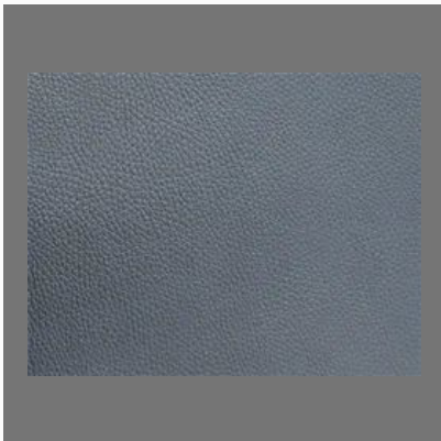
Buffalo Grain Barton Finished Leather