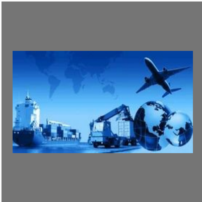
Clearance Of Import and Export Cargo