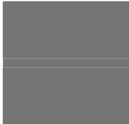
Clearance of Baggage Import and Export