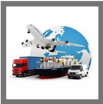
Freight Forwarding Services