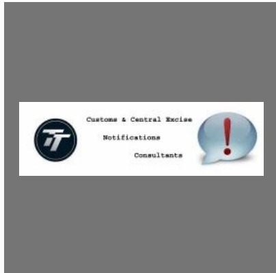
Refund of Central Excise on Import on Goods Consultancy