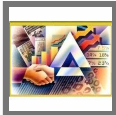
Registration of License Custom and Excise Consultancy