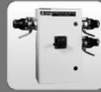
Power Receptacles Range