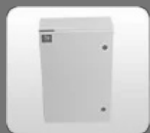
Bhartia Boxes Range