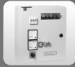
Submersible Pump Starters