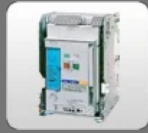
Air Circuit Breakers