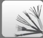
Wires & Cables