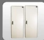
Techno-Modular Enclosures Modular Enclosures