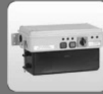
Oil Immersed Starters