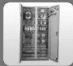
Crane Control Panels