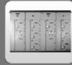
MCC & PCC