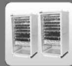
Punched Grid Resistors