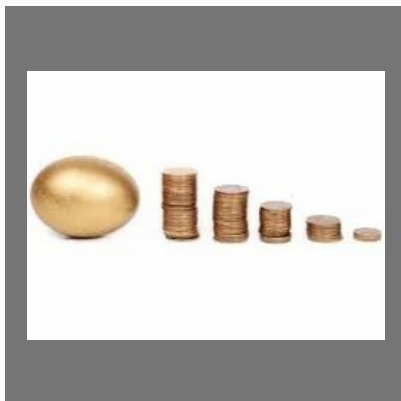
Special Asset Finance