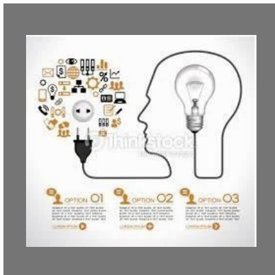
Idea & Technology Finance