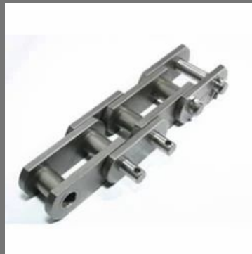
Coal Conveyor Chain