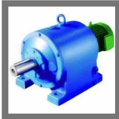
Inline Gear Motor