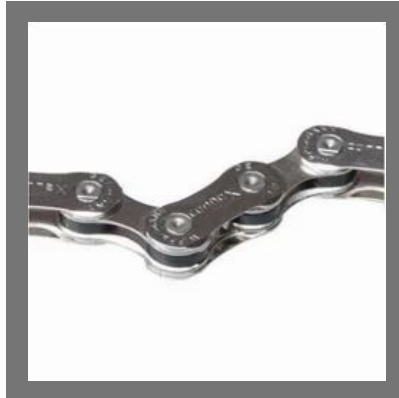
Nickel Plated Roller Chain