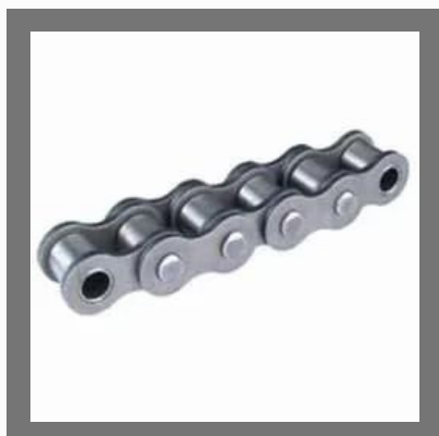
Zinc Plated Roller Chain