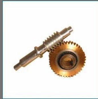
Worm & Worm Wheel Gears