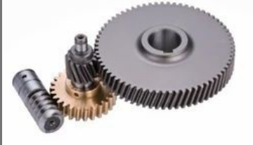
Worm Wheel Gears