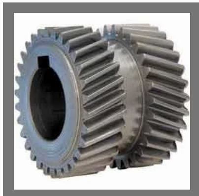
Double Helical Gears