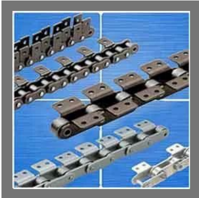
Attachment Roller Chain