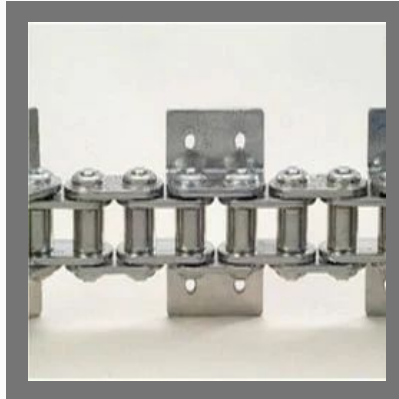
Stainless Steel Roller Chain