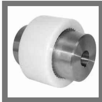
Nylon Sleeve Gear Coupling