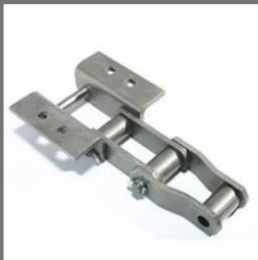
Asphalt Conveyor Chain