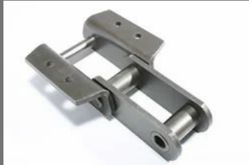
Cement Conveyor Chain