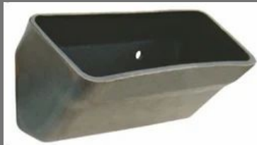
Steel Elevator Buckets