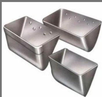
Seamless Steel Elevator Buckets