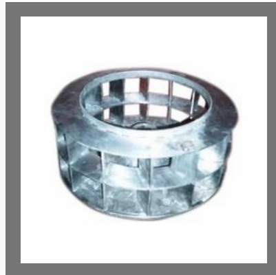
2 Tier Furnace Impellers