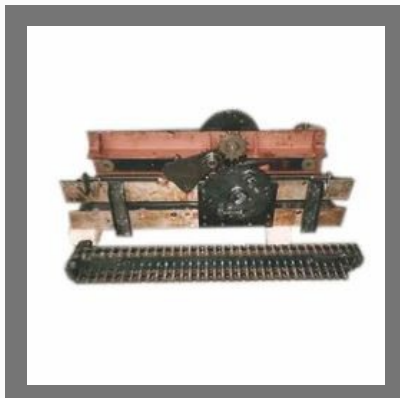
Industrial Furnace Charge Machine