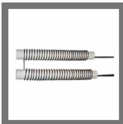
Furnace Heating Elements