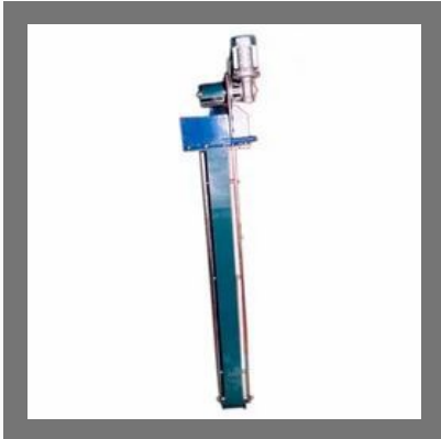
STP Oil Skimmer