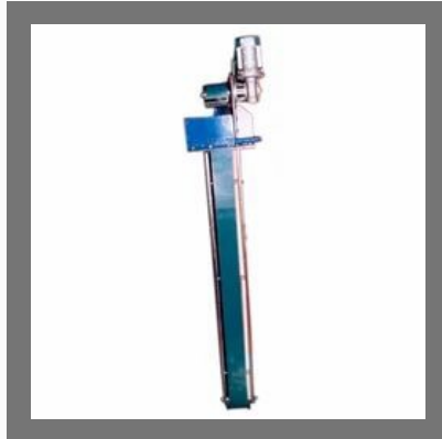
Industrial Oil Skimmer