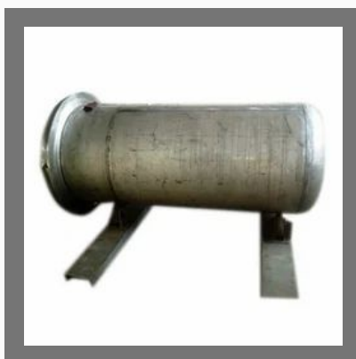
Industrial Furnace Retorts