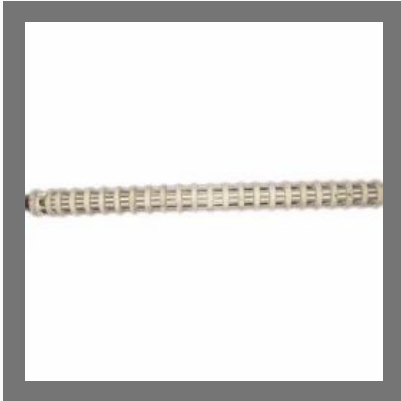
Radiant Tube Heater