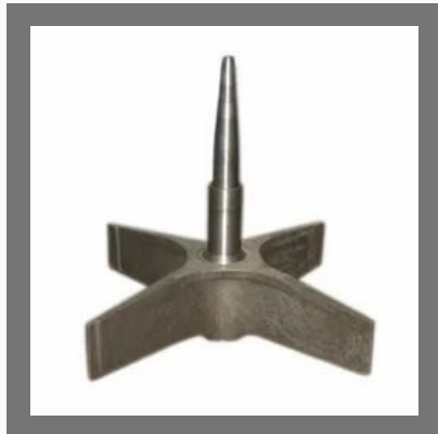
Impeller With Integral Shafts