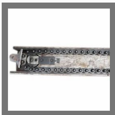
Furnace Charge Machine