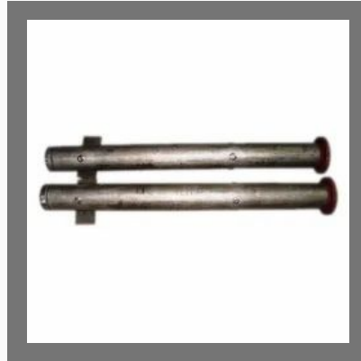
Furnace Radiant Tube