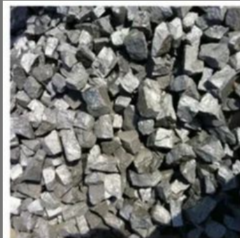
Ferro Silicon Manganese