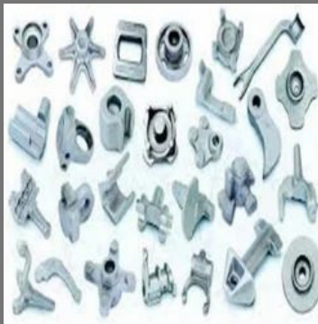
Forged Machine Components