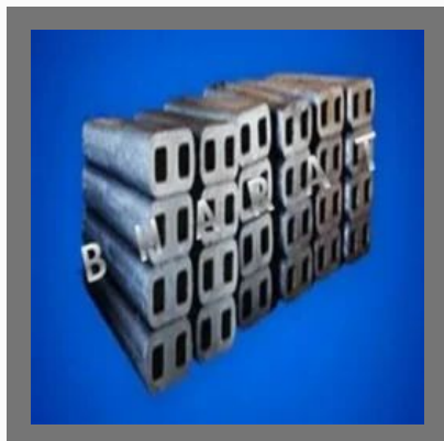
Ci Duplex Ingot Mould