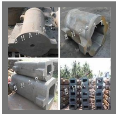
Cast Iron Slab Moulds