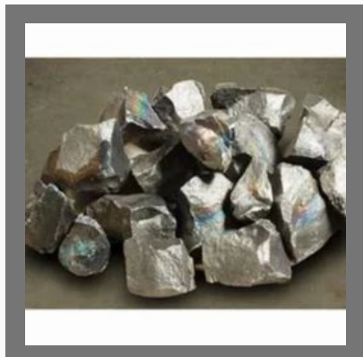
Ferro Silico Manganese