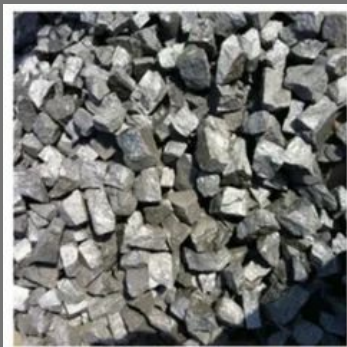
Ferro Silico Manganese