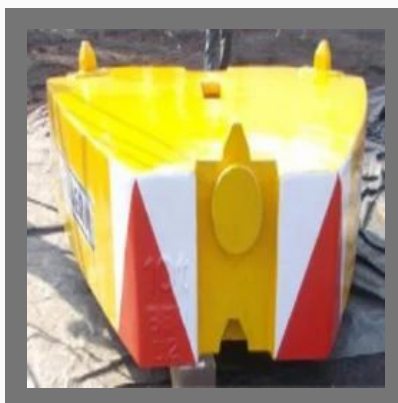
Elevator Counter Weight