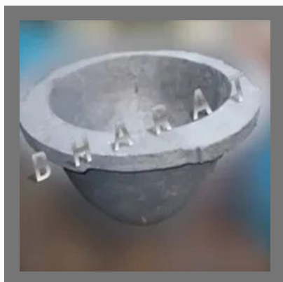
C I Crucible Mush