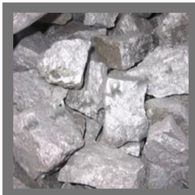
Bharat Engineering Works Ferro Silicon Manganese