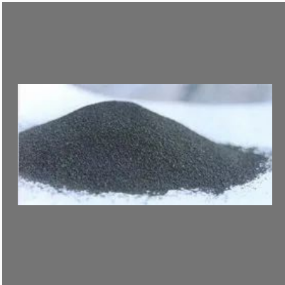
Furnace Refractories ,