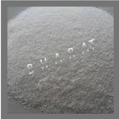
Casting Mould Powder