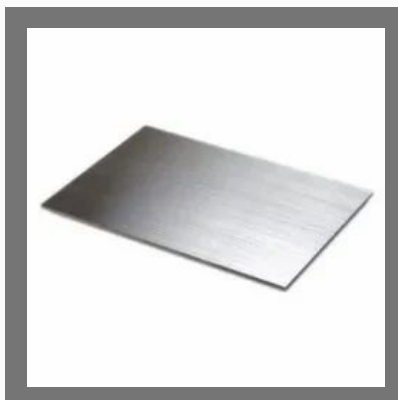
Metal Sheet Plate