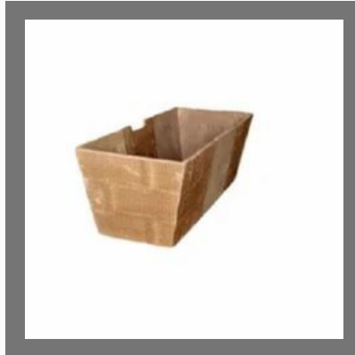
Silica Tundish Boards