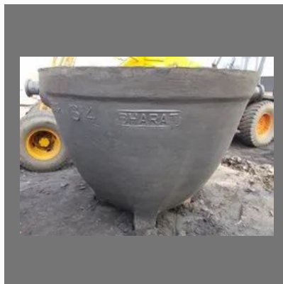
Cast Iron Slag Pots