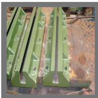
Cast Iron Foundation Rail