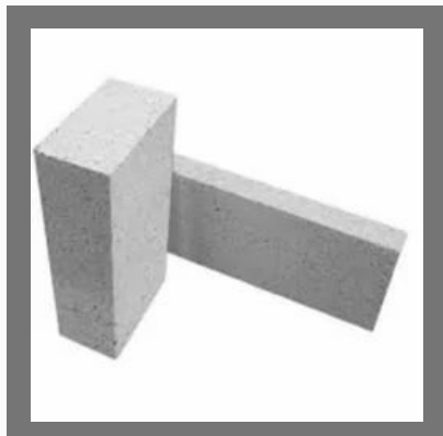
General Purpose Refractories