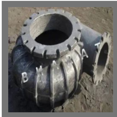
Ci Impeller Body