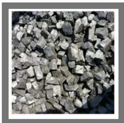
Sponge Iron Lumps