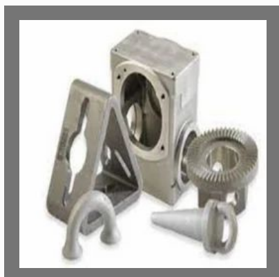
Ductile Iron Casting