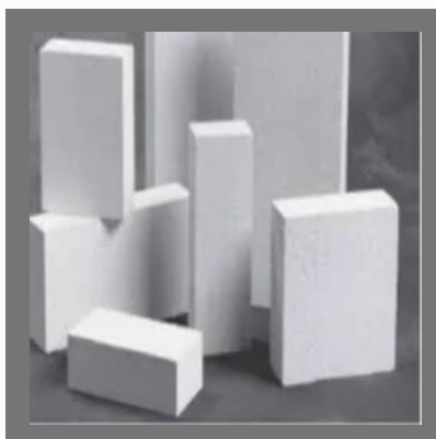
Insulating Refractories ,