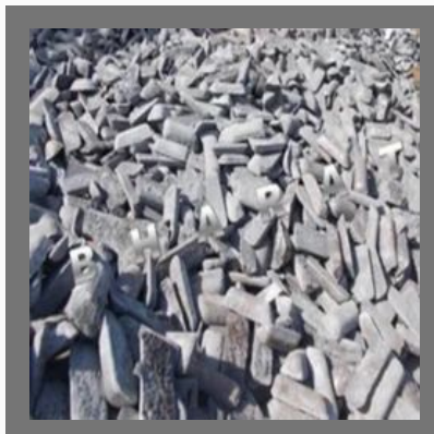
Pig Iron Steel