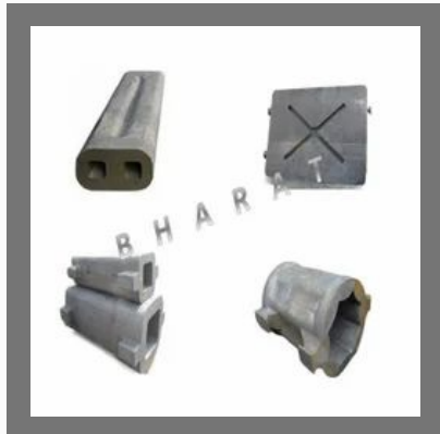
Cast Iron Singlet Ingot Moulds