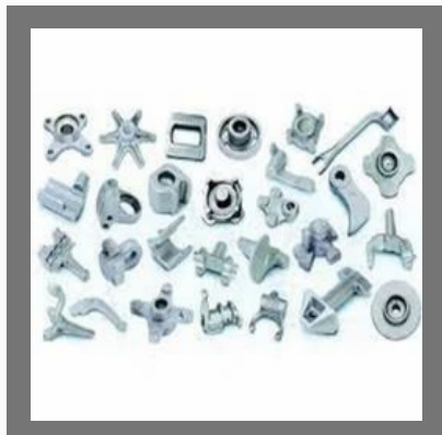
Automotive Forging ,