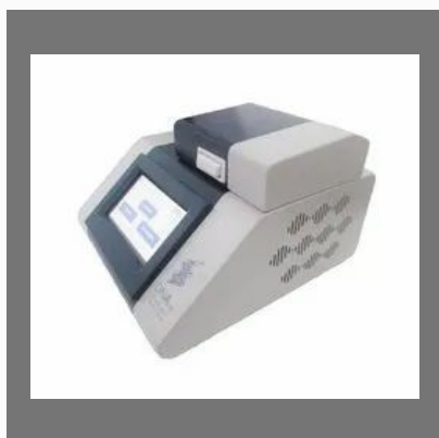
DNAm Thermal Cycler