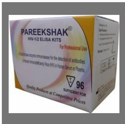
PAREEKASHAK HIV - 1/2 3rd Gen. Elisa Test Kit