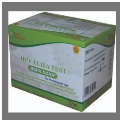
HCV Elisa Test Kits