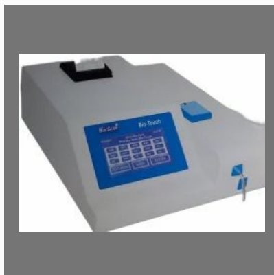
BIO-TOUCH Semi Auto Bio-Chemistry Analyzer