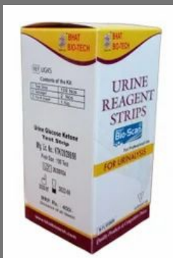
Urine Glucose Ketone Strips