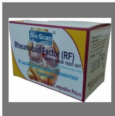
RF Latex Slide Test Kit