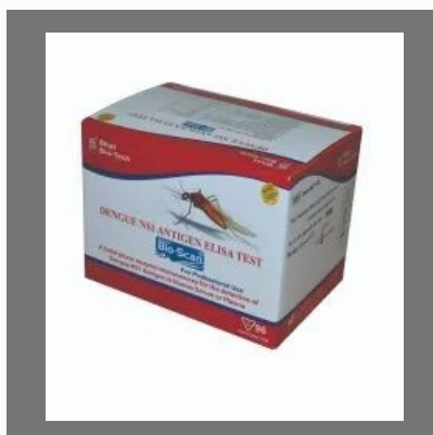
Bhat Bio-Scan Dengue Ns1 Antigen Elisa Kit