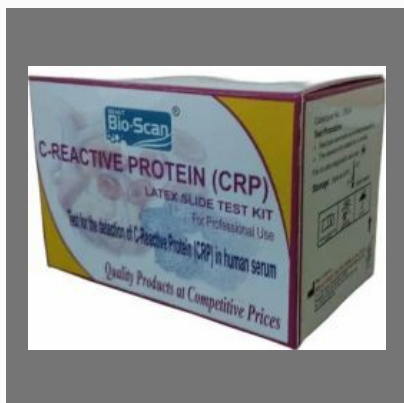
CRP Test Kit