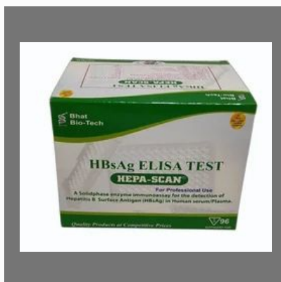
HBsAg Elisa Test Kit