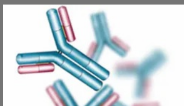
Monoclonal & Polyclonal Antibody Production