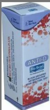
BHAT BIO-SCAN Anti D IgM Sera ( Monoclonal)