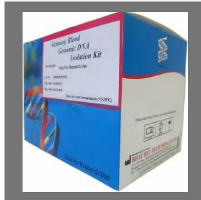
Geneasy Blood Genomic Dna Isolation Kit