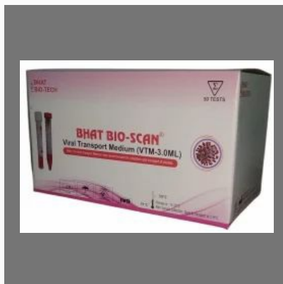
Bhat Bio-Scan Viral Transport Media (VTM) Kit