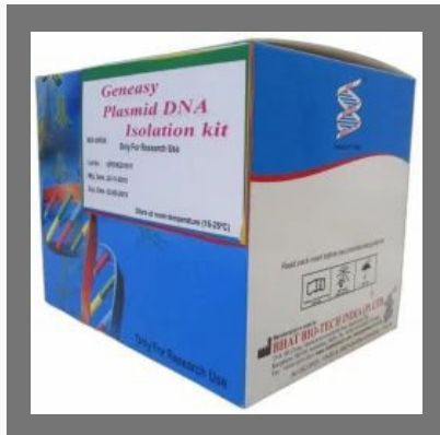
GENEASY PLASMID DNA ISOLATION KIT