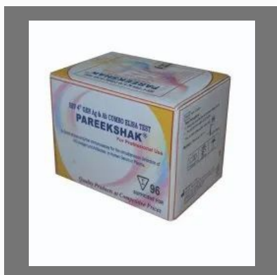
PAREEKASHAK HIV 4th Gen. Ag & Ab Combo Elisa Kit