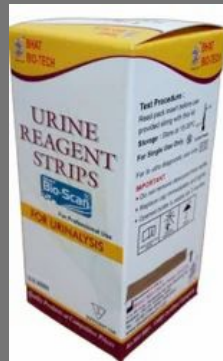
BHAT BIO-SCAN Urine Glucose Protein Test Kit