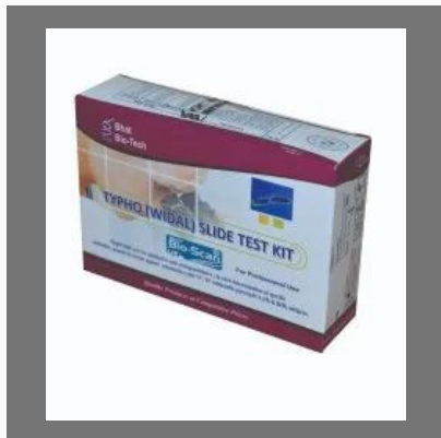
Typhoid Test Kit