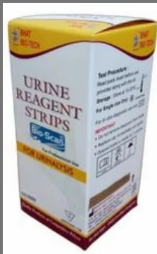
BHAT BIO-SCAN Urine Glucose Test strips