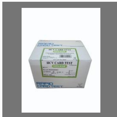
HCV Card Test