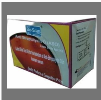
ASO Test Kit