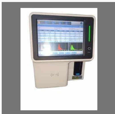
Cell-Touch Haematology Analyzer