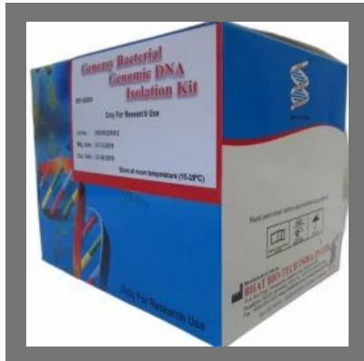
Geneasy Bacterial Genomic Dna Isolation Kit