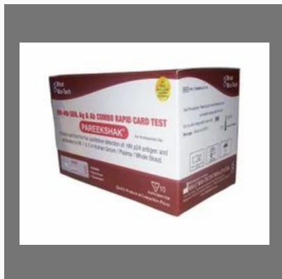
PAREEKSHAK HIV 4th Gen. Ag & Ab Combo Rapid Card Test