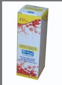
BHAT BIO-SCAN Anti B (IgM) Sera Monoclonal