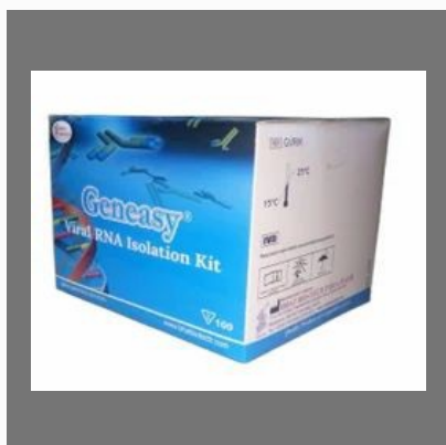
Geneasy Viral RNA Isolation Mini Kit, ICMR Approved