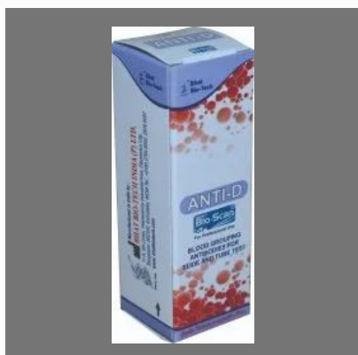
BHAT BIO-SCAN Anti-D ( IgG IgM) Sera Monoclonal