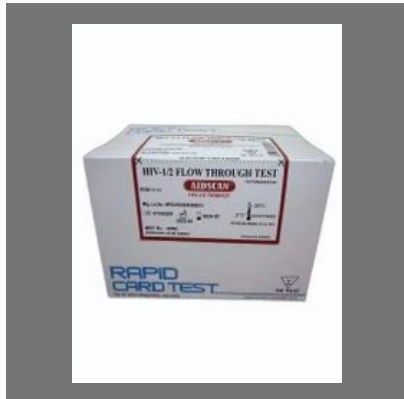
AIDSCAN HIV-1/2 Trispot Test Kit