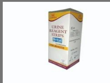
BHAT BIO-SCAN U5P Urine Strip