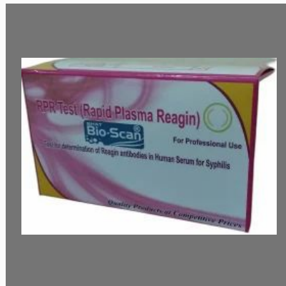
RPR Test Kit