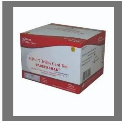
HIV 1/2 Triline Card Test