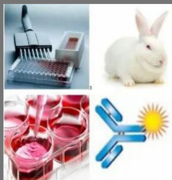
Microbial Barcoding Services