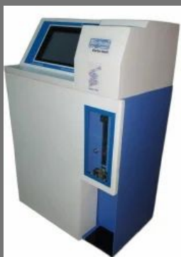
Electro-Touch Electrolyte Analyzer