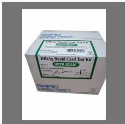
HEPA-SCAN HBsAg Card Test Kit