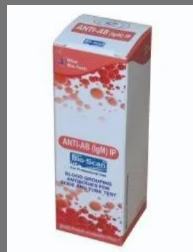
BHAT BIO-SCAN Anti-AB (IgM) Monoclonal