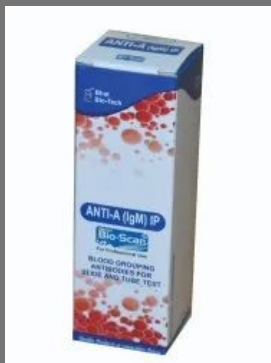
BHAT BIO-SCAN Anti A (IgM) Monoclonal