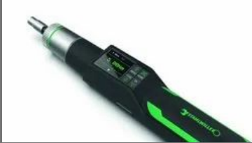
DAPTIQ TORQUE SCREW DRIVER