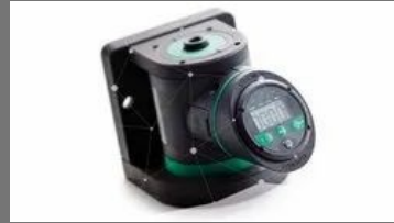
Smrat Checker- Torque Tester