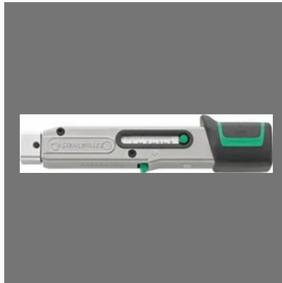
Standard Torque Wrench