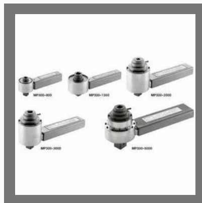
Stahlwille Multipower Unit