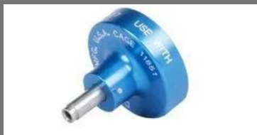
Positioners For Crimp Tools- K42