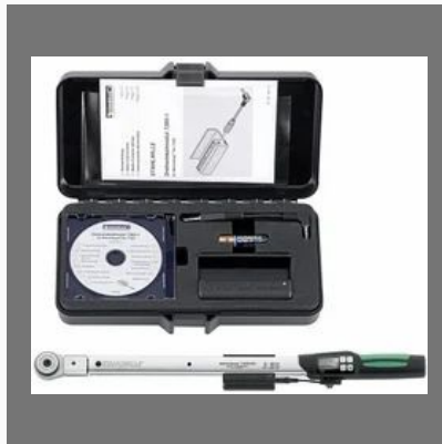
Stahlwille Electromechanical Digital Torque Wrench