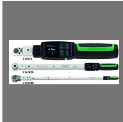
Stahlwille Monoskop Tightening Angle Torque Wrenches