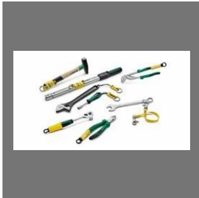
STAHLWILLE Safety Tools