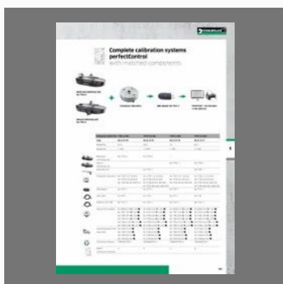
Stahlwille Complete Calibration Systems