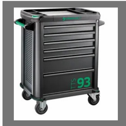
Automobile Tool Trolley