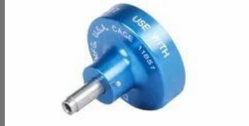
Positioners For Crimp Tools- K40