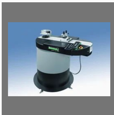
Stahlwille Perfect Control Unit