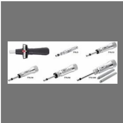
Stahlwille Torque Screwdriver