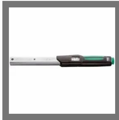
Stahlwille Basic Manual Wrench