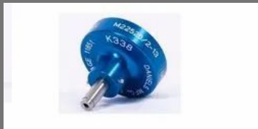
Positioners for Crimp Tools- K338