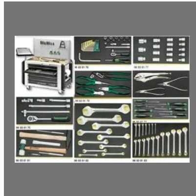
Stahlwille Premium Tool Trolley And Tools Set