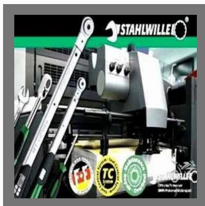
Stahlwille Tightening Tools