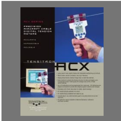
Tensitron Wire Tension Measuring Unit