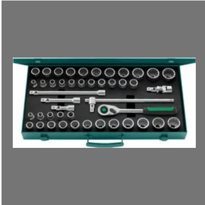
Stahlwille Socket Tools, Drives