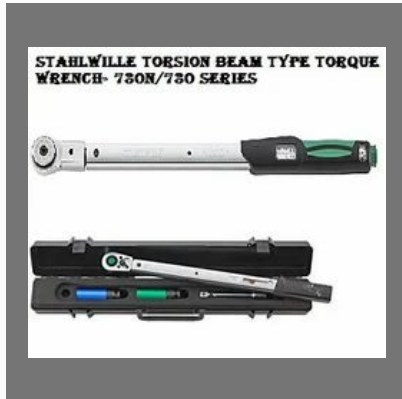
Torsion Beam Type Of Torque Wrench- 730n/730 Series