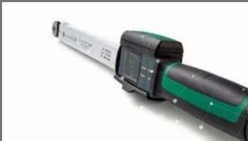
Wireless TORQUE wrenches