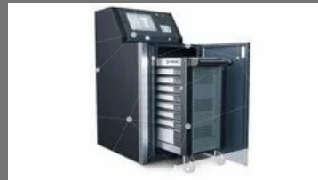
Tool Cabinet Checker