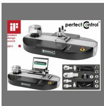
Stahlwille Motorised Calibrating And Adjusting Equipment