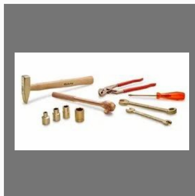
STAHLWILLE Non sparking Tools