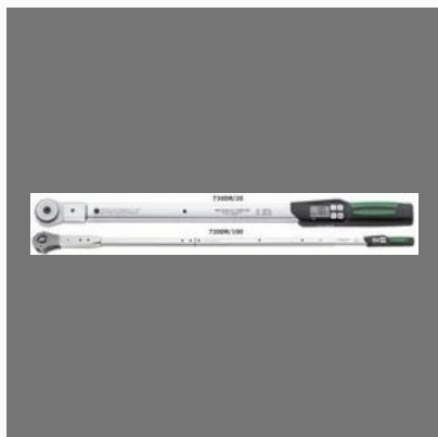
Stahlwille Electromechanical Torque Wrenches