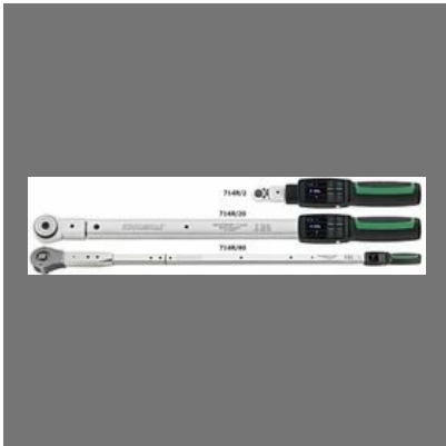
Electromechanical Torque Wrench