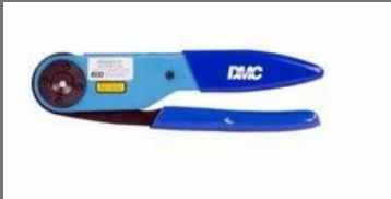
DMC AFM8 M22520/2-01/ Daniels Crimp Tool