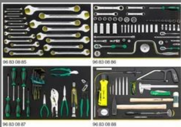
Stahlwille Production Hand Tools