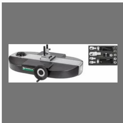
Torque Wrenches Calibration Equipment