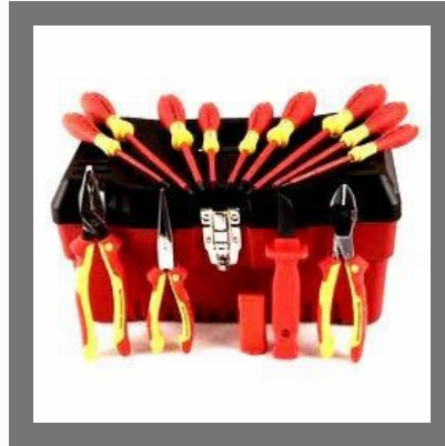
VDE Insulated Tools