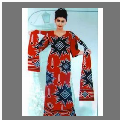
Cotton Printed Kaftans