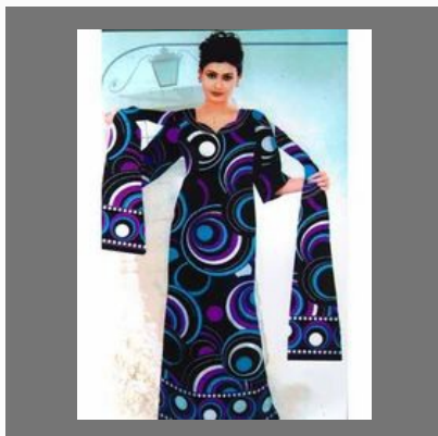
Cotton Printed Kaftans