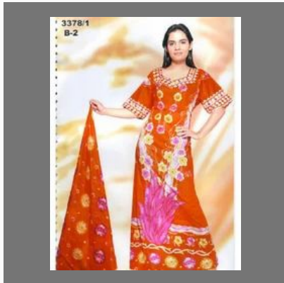
Cotton Printed Kaftans