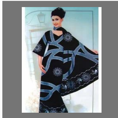
Cotton Printed Kaftan