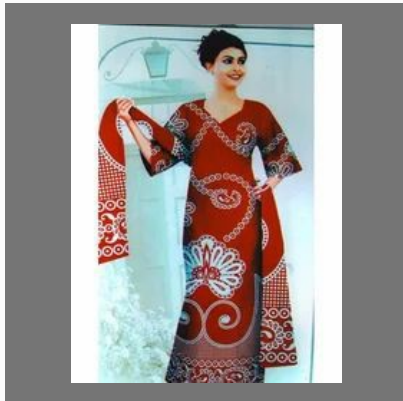
Cotton Printed Kaftans