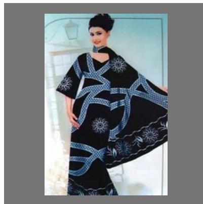
Cotton Printed Kaftans