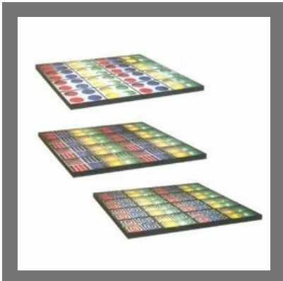
Lighting DJ Floor