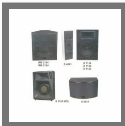
Full Range Electric Enclosures