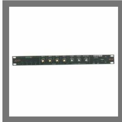
Digital Audio Effort Processor