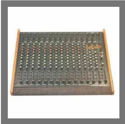
PRO Series Studio Mixers