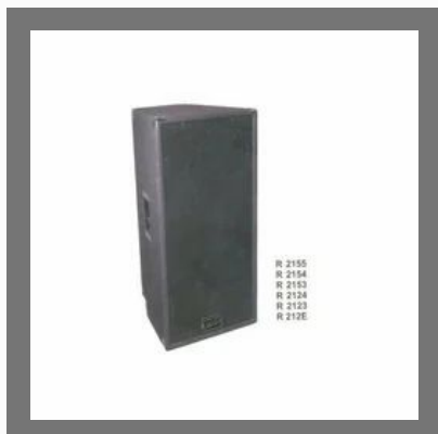
Full Range Enclosures