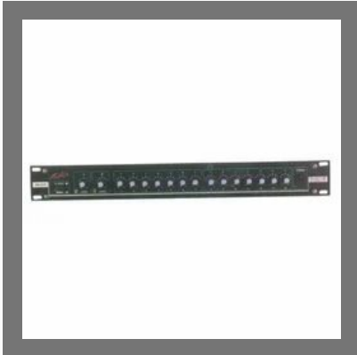
Balanced Line Distributor Amplifier