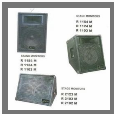
Monitor Audio Equipments