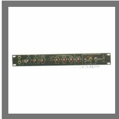
Analog Audio Effect Processor