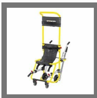
Stair Evacuation Cum Wheelchair