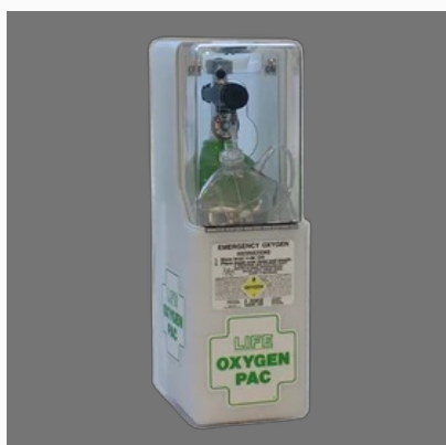
EMERGENCY OXYGEN KIT (OXY PAC)