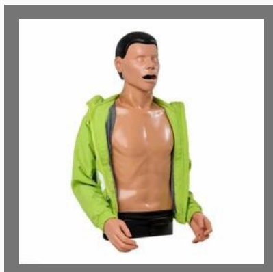
Level 3 - Airway & CPR Manikin with integrated feedback Systems