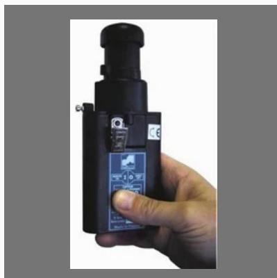
Personal Dust Sampler