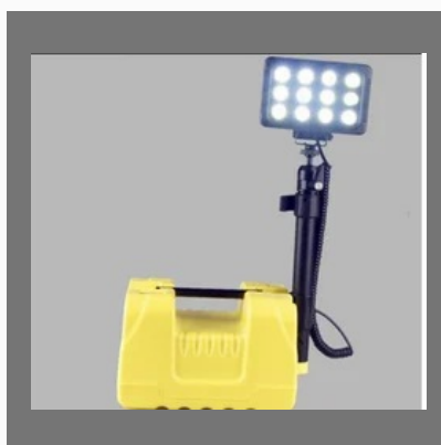
Emergency Rechargeable LED Hand Light 3699