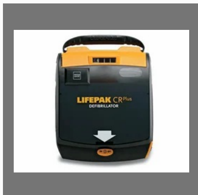
Automated External Defibrillator (AED)