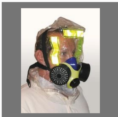
Smoke & Fire Hood