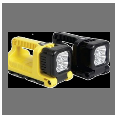
Emergency Rechargeable LED Hand Light 1299