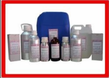
Flavours For Food And Pharma Processing Industry