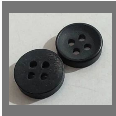
16 line 2.8 mm final Black Garment Button