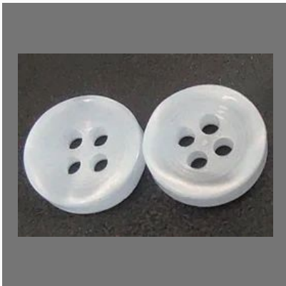
18 line 2.4mm final 4 Hole White Round Plastic Shirt Button