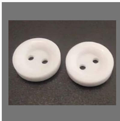
24 line 3mm final White Chalk Button