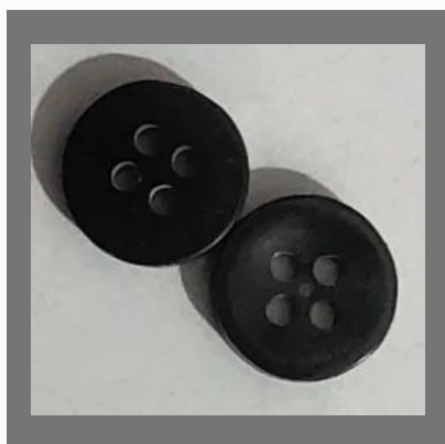
18 line 2.4mm final_pearl black button