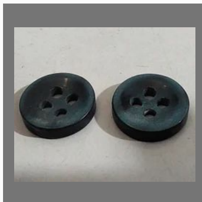
18 line 2.4mm final_pearl Dark gery button