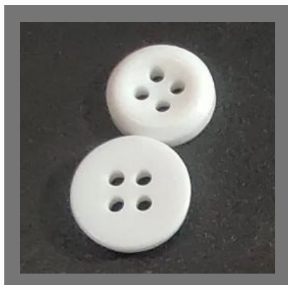
20 line 2.8mm final_Matka shape White chalk Button