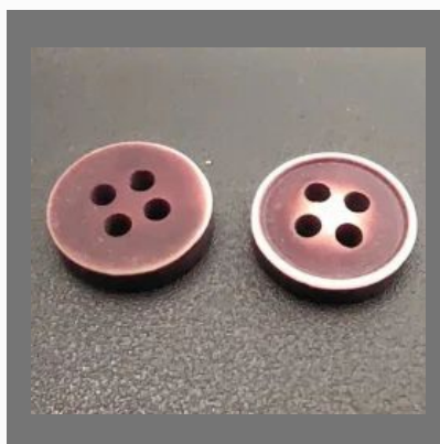
18 line 2.6mm final_Dey Ring button