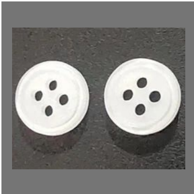
16 line 2.2mm final_button name 9413