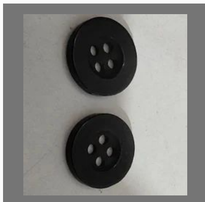
24 line 2.6mm final_Black Round chalk Button