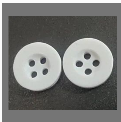
24 line 2.4 mm final_Round White chalk