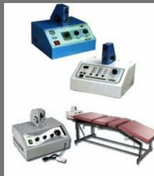
Cervical And Lumbar Traction