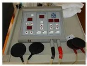
Electrical Muscle Stimulations