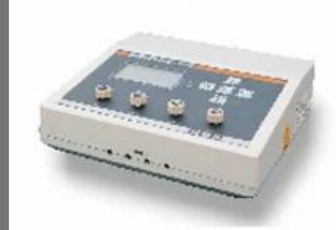
Transcutaneous Electrical Stimulations