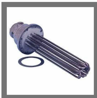
Process Water Heaters