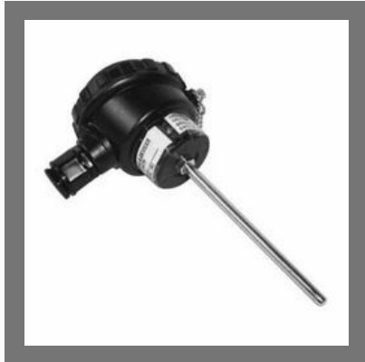
Type PT Thermocouples