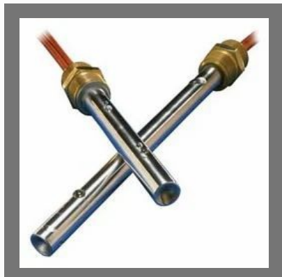
Water Immersion Heaters