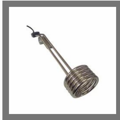
Cooking Oil Heaters