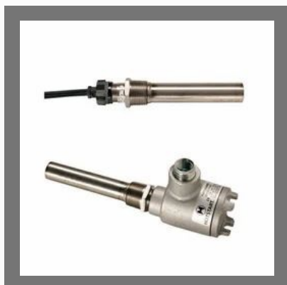
Lube Oil Heaters