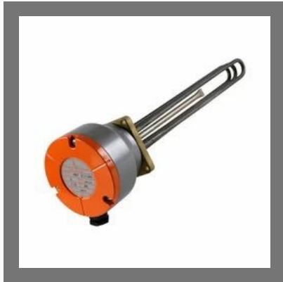
Industrial Immersion Heaters