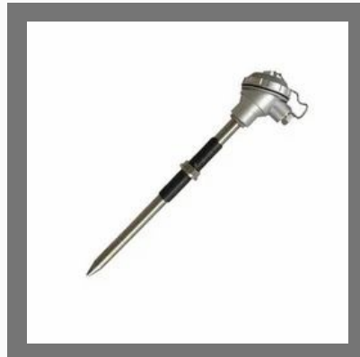
Type J Thermocouples