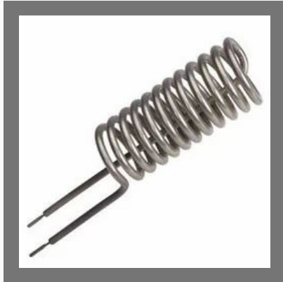
Single Ended Tubular Air Heaters