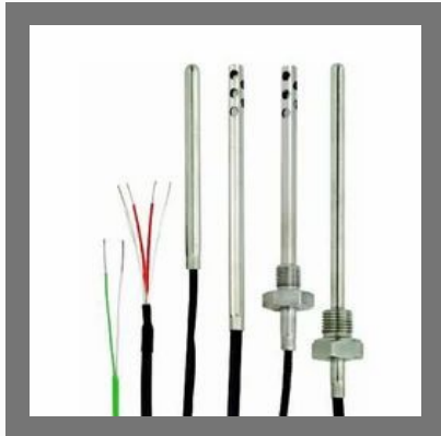
High Temperature Thermocouples