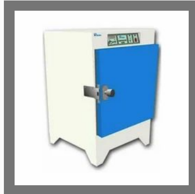
Horizontal Forced Air Convection Ovens