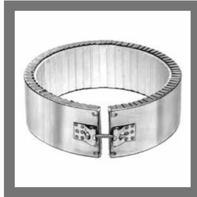
Air Cooled Ceramic Band Heaters