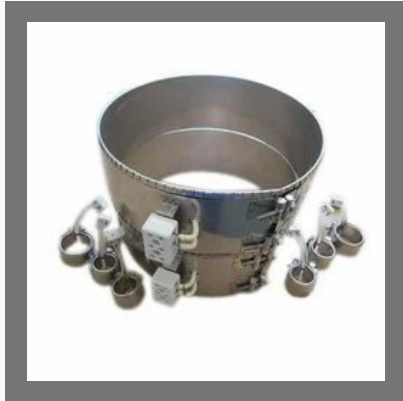
Industrial Band Heaters