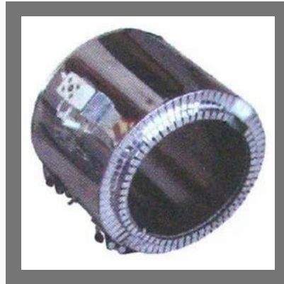
Power Saving Heaters