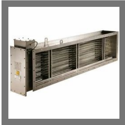
Air Duct Heaters