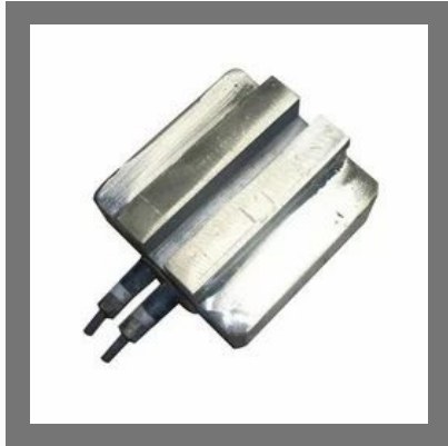
Metal Casted Heaters