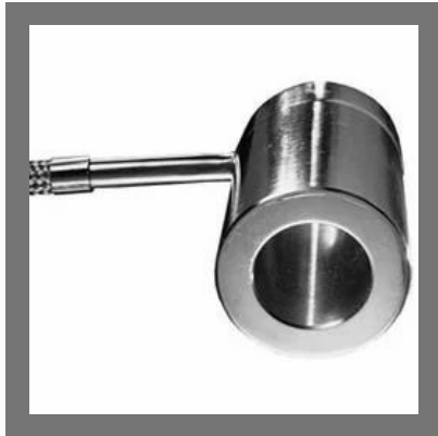
Mica Band & Nozzle Heaters