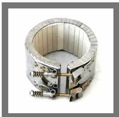
Ceramic Band Heaters