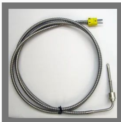
Type K Thermocouples