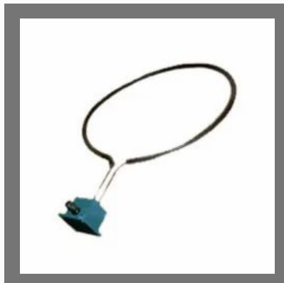
Custom Built Heaters