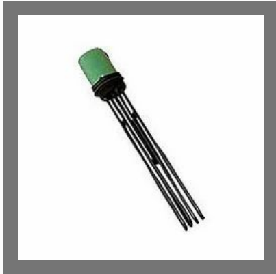
Kettle Immersion Heaters