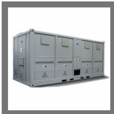
Resistive Load Banks