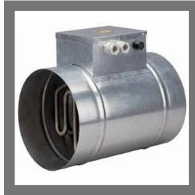
Industrial Air Duct Heaters