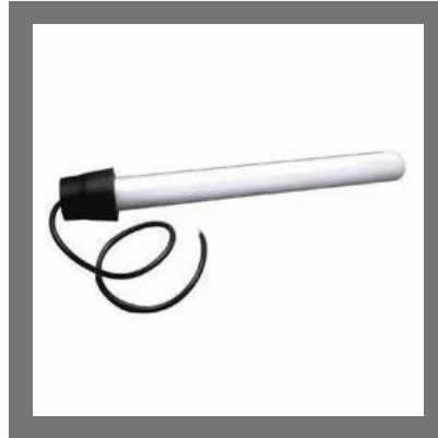
Silica Cased Immersion Heaters