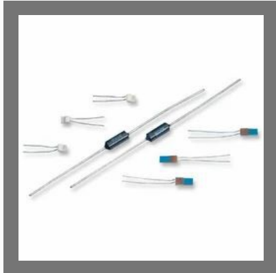
Resistance Temperature Detectors