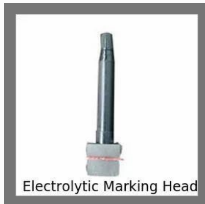
Electrolytic Marking Head