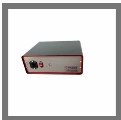
Electrolytic Etch Marking Machines