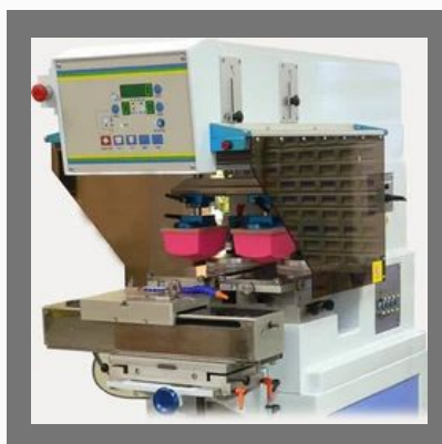
Color Pad Printing Machine