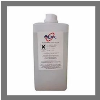
Electrolytic Etching Marking Chemicals