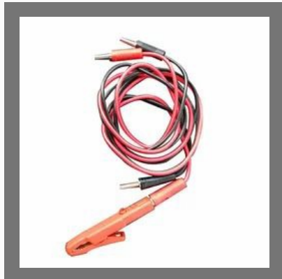
Electrolyte Marking Lead