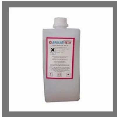
Electrolytic BT 26