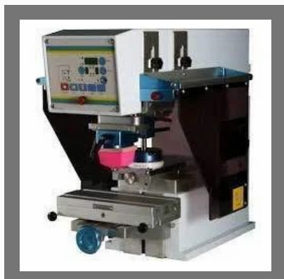
Pad Printing Machine