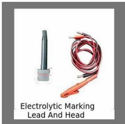
Electrolytic Marking Lead And Head