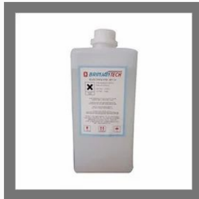
Electrolyte AE-34 Chemicals