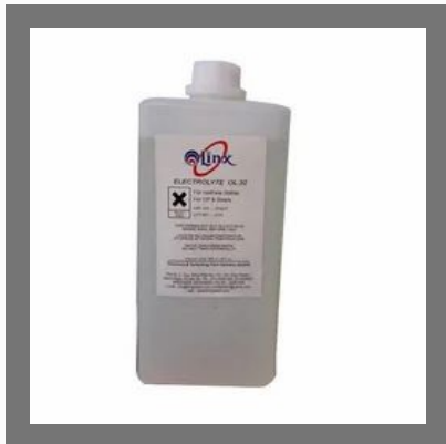
Electrolyte OL31 Chemical