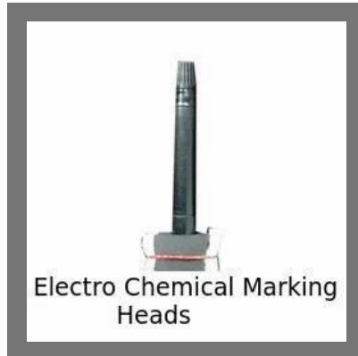
Electro Chemical Marking Heads