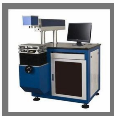
Laser Marking Machine