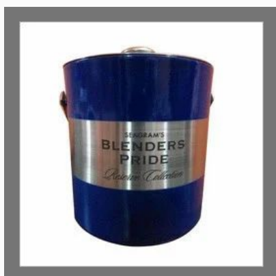
Electrolytic Marking Sample