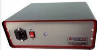
Metal Marking Machine