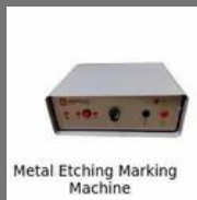
Metal Etching Marking Machine