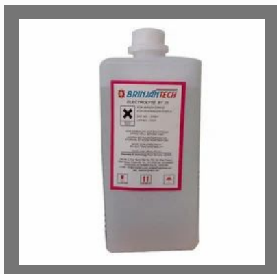
Electrolytic Marking Chemicals