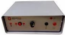
Metal Etching Marking Machine