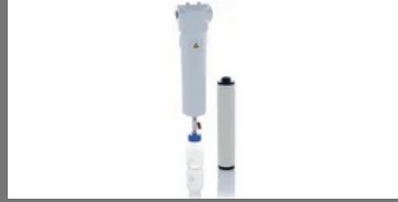
Medical Vacuum Filter