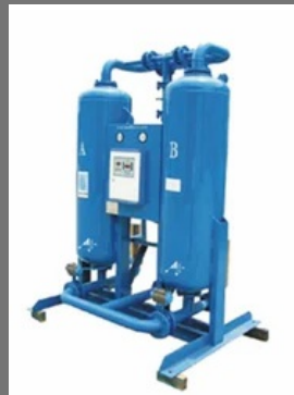
Heatless Air Dryer