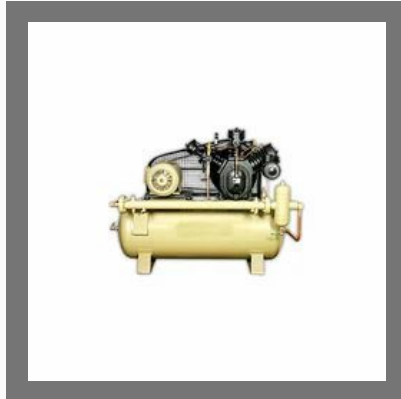
High Pressure Air Compressor