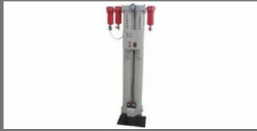
Medical Air Dryer