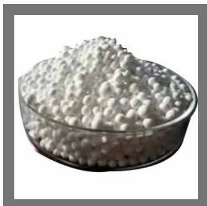
Activated Alumina Balls