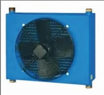
Air Cooled Aftercooler