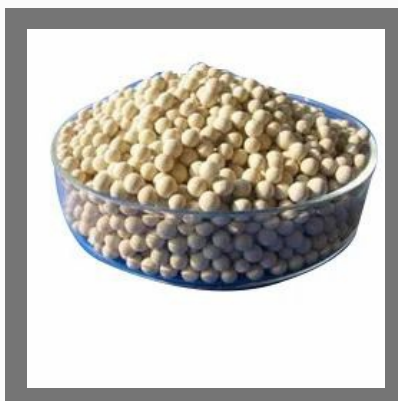
Molecular Sieves Beads