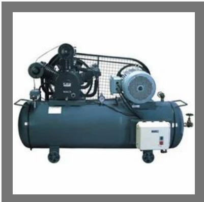
Oil Free Reciprocating Air Compressor