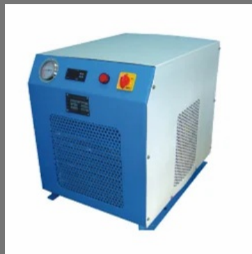
Refrigerated Air Dryers