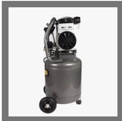
Oil Free Air Compressor