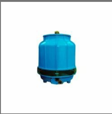
Water Cooling Tower