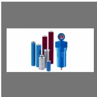
Micron Air Filter