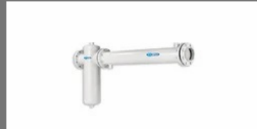
Water Cooled Aftercooler