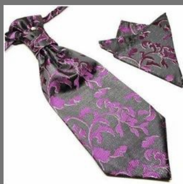
Men's Formal Ties