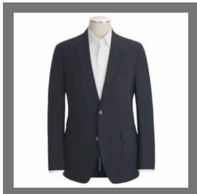
Men's Formal Blazer