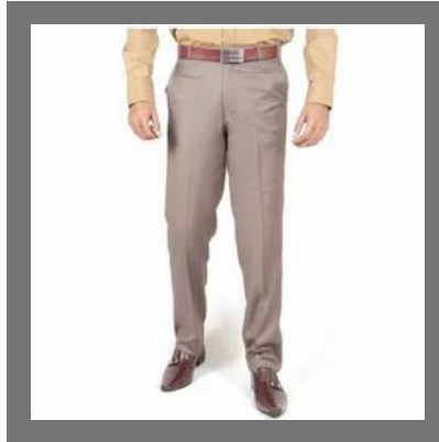
Gents Formal Pant