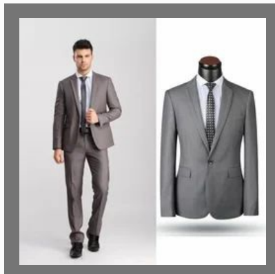
Men's Casual Blazer