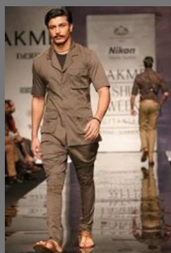
Men's Safari Suit