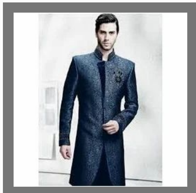
Indo Western Suit