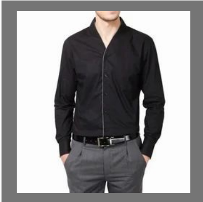
Gents Formal Shirts