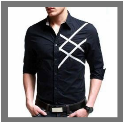
Gents Casual Shirts