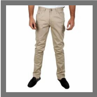
Gents Casual Pant