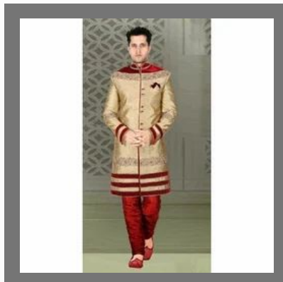
Designer Indo Western Suit