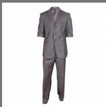
Designer Safari Suit