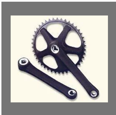
Single Chain Wheels