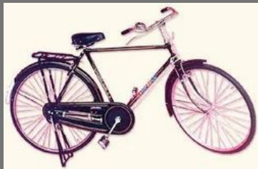
Raleigh Type Bicycle