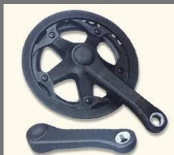
Single Chain Wheels