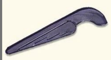
Chain Cover-baloon Type Steel