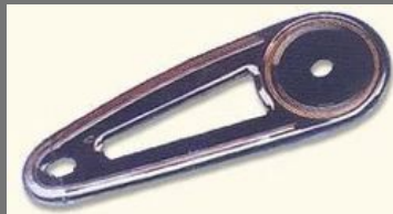
Full Chain Cover