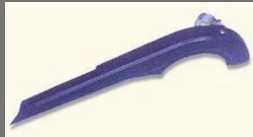
Chain Cover- Pvc Black