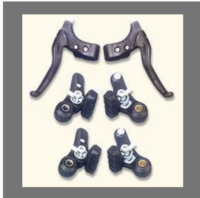
Cantilever Brake Set Plastic Moulded