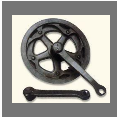
Single Chain Wheels