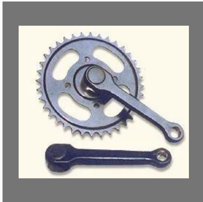
Single Chain Wheels