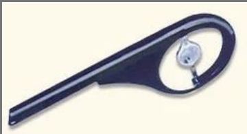
Chain Cover-steel Black