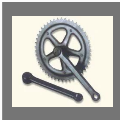
Single Chain Wheels