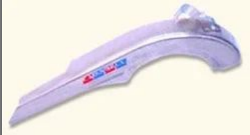
Chain Cover-Pvc Translucent