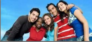
Student Visa Consultants