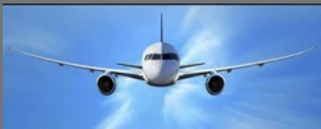
Air Ticket Booking