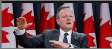
Canada PR Benefits Immigration Consultancy