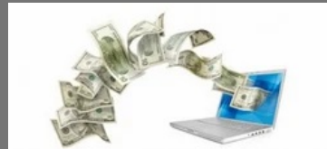
Foreign Money Exchange Service