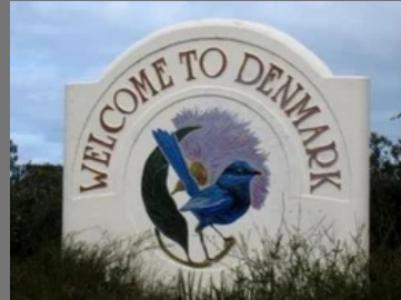
Denmark PR Benefits Immigration Consultancy