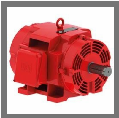
Electrical Fire Pump