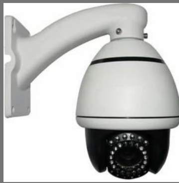
High Speed Dome Camera