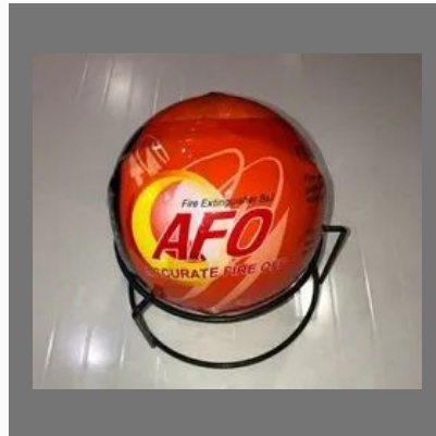
Auto Fire Off AFO Fire Safety Ball