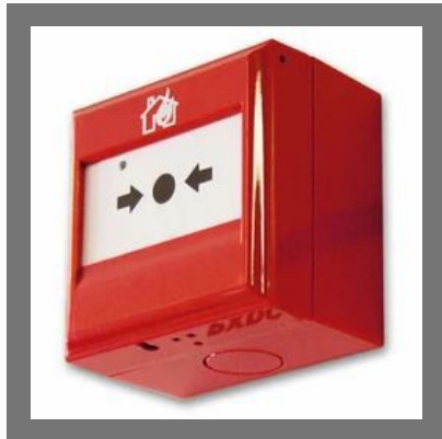
Manual Call Point