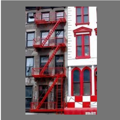
Emergency Escape Staircase