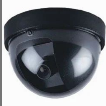
Dome Surveillance Camera