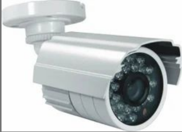
Bullet CCTV Camera 2 MP