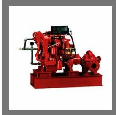
Diesel Engine Fire Pump