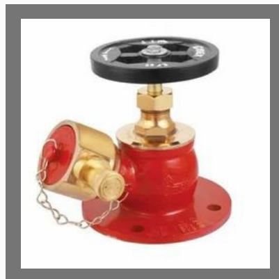
Fire Hydrant Valve