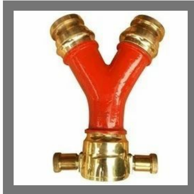
GM Dividing Breaching