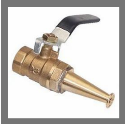
Shut Off Nozzle