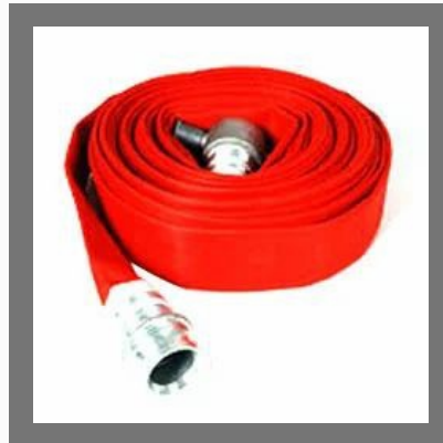
Fire Hose Pipe