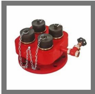
4 Way Fire Brigade Inlet