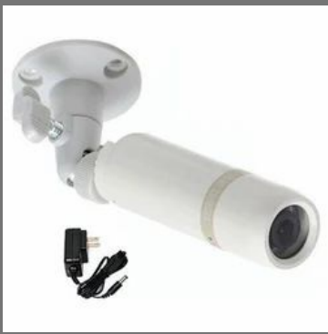
Outdoor CCTV Camera