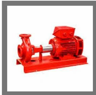
Fire Jockey Pump