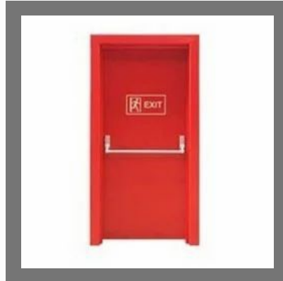
Fire Resistant Door