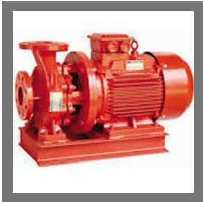
Fire Booster Pump