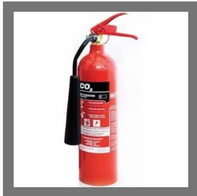
Carbon Dioxide Fire Extinguisher (4.5 kg)