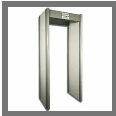
Metal Detector Door Frame