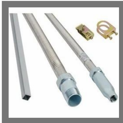
Flexible Sprinkler Drop (1500 Mm)