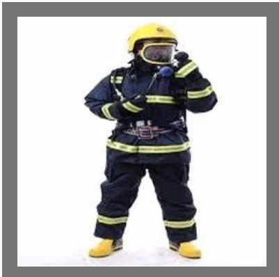
Fire Fighting Suit