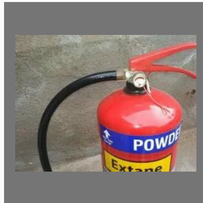
Extinguisher Refilling Service