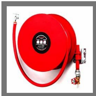
Hose Reel Drum Set