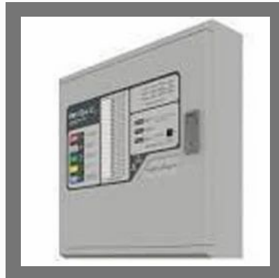
Fire Alarm Panel