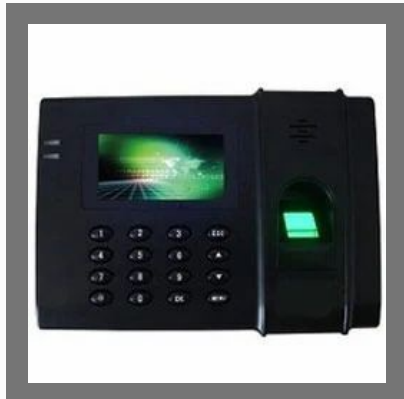
Biometric Attendance System