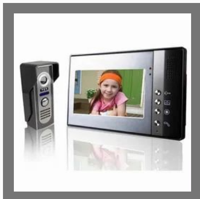
Video Door Phone