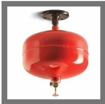
Modular Type Fire Extinguisher