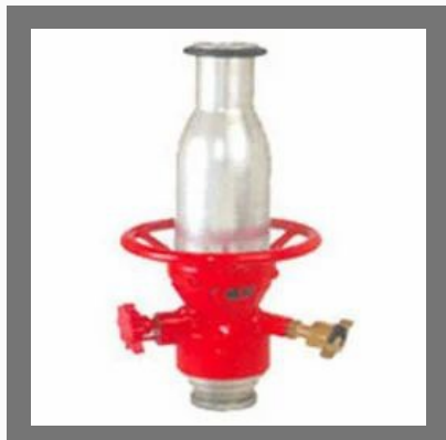
Foam Making Branch Pipe