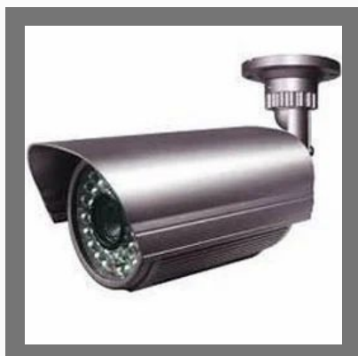
CCTV Surveillance Camera