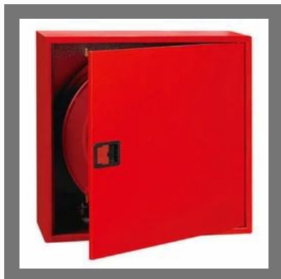
Hose Box Single