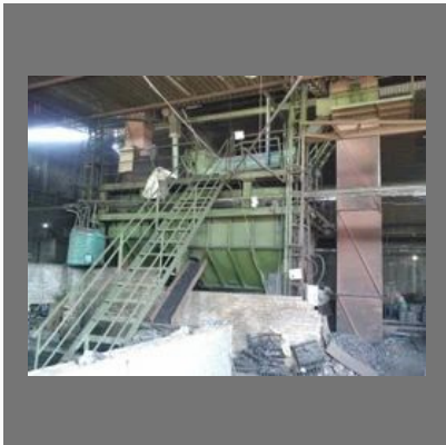
Foundry Sand Plant