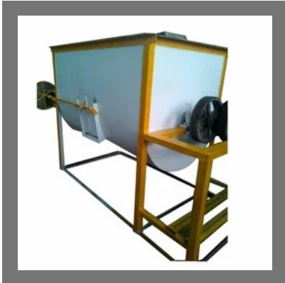
Feed Mixer Machine