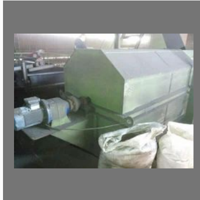
Rotary Sand Screening