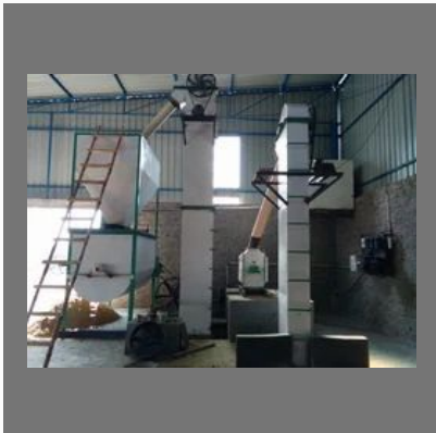
Semi Automatic Poultry Feed Plant