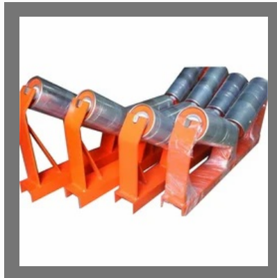
Self Aligning Carrying Idler