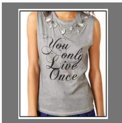
Girls T Shirt Printing