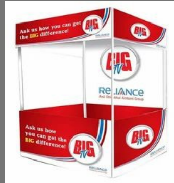
Canopy Printing Services