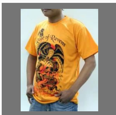
Color T Shirt Printing