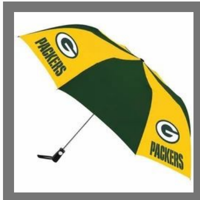
Umbrellas Printing Services