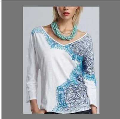
Designer T Shirt Printing