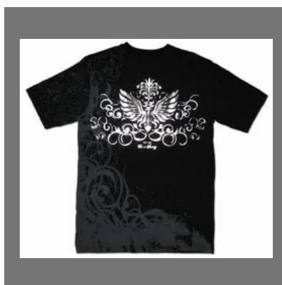
Round Neck T Shirt Printing