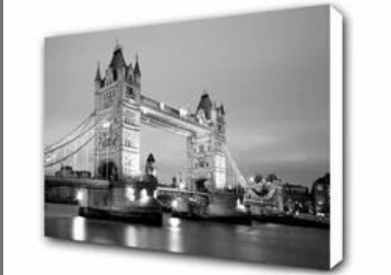
Custom Printing Services