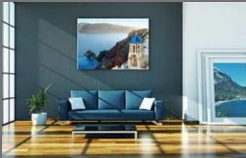
Custom Printing For Walls