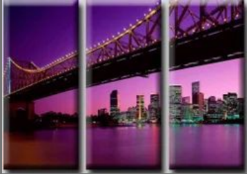
Art Digital Printing