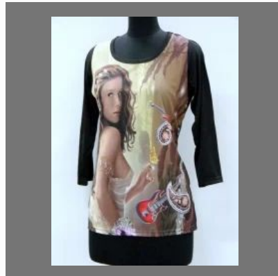
Ladies T Shirt Printing