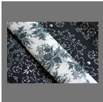
Dye Sublimation Printing