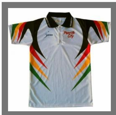
Sublimated Sports Wear