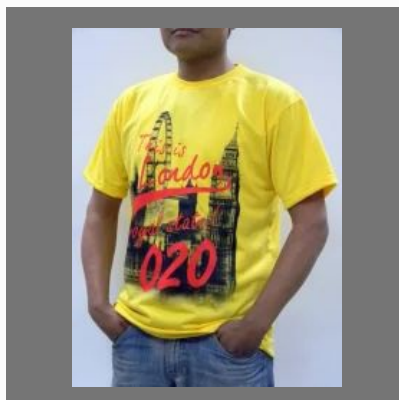
T Shirt Printing