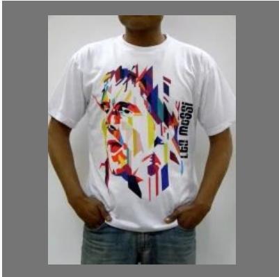
Digital Printing on Garments