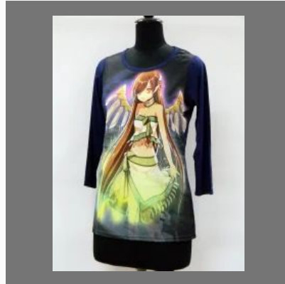
Printing on Ladies Top