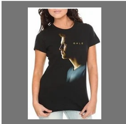
Designer Top Printing