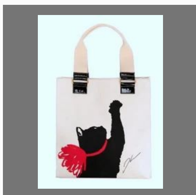
Canvas Shopping Bag