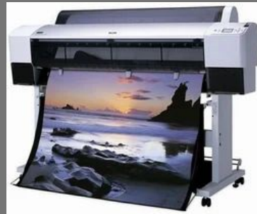
Poster Art Printing