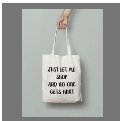
Printed Canvas Tote Bag