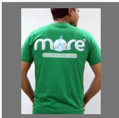
Promotional T Shirt Printing