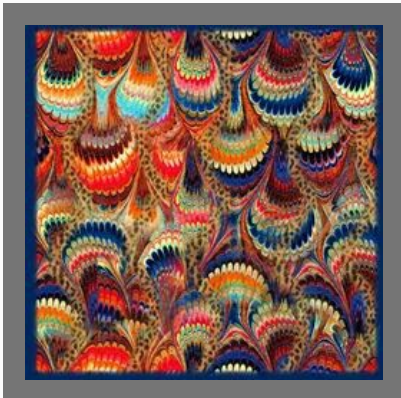
Digital Scarves Printing