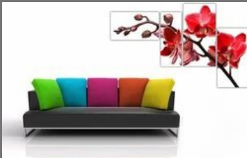
Custom Cushion Printing