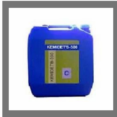
Kemidet Wetting Agent