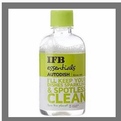
IFB Rinse Aid