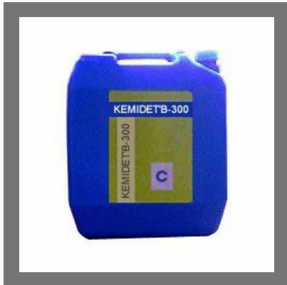
Multipurpose Institutional Cleaner and Wetting Agent