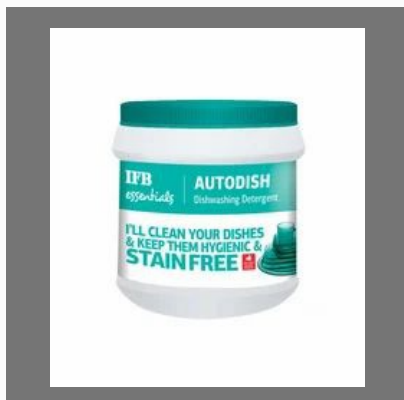
IFB Essential Autodish