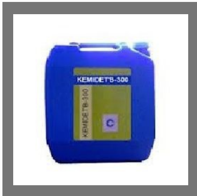
B300 Kemidet Wetting Agent