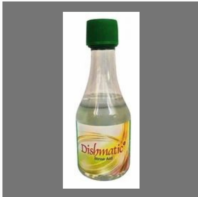
Dishmatic Rinse Aid