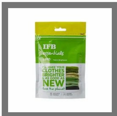
IFB Limo Fabric Brightener