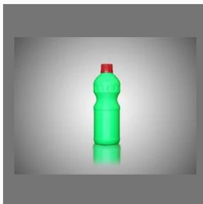
Pine Oil Sanitizers