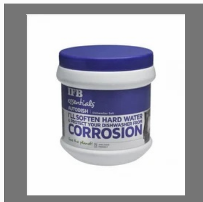
IFB Autodish Salt