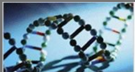
Deuterium Labeled Compounds