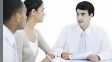
Arbitration & Conciliation Services