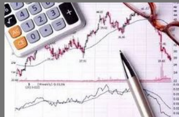
Finance and Accounting Services