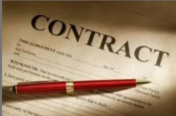
Drafting & Legislative services