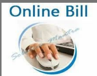
Utility Bill Payments Service