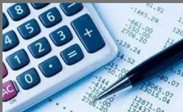
Telephone Billing Service