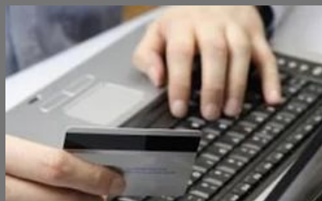
Electricity Billing Service