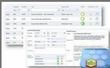
Document Review and Management Solutions