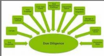
Due Diligence Service