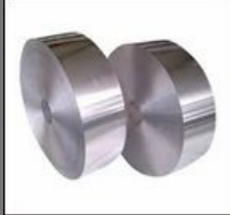
Aluminium Blister Foils