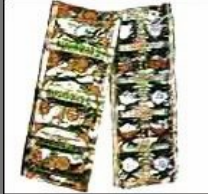
Aluminium Pharma Foils