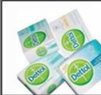
Chromo Coated Paper