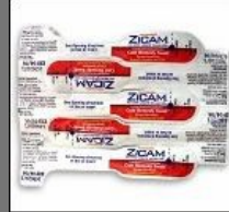
Glassine VMCH Paper