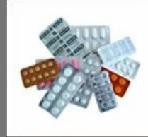
4 Ply Alu Laminates