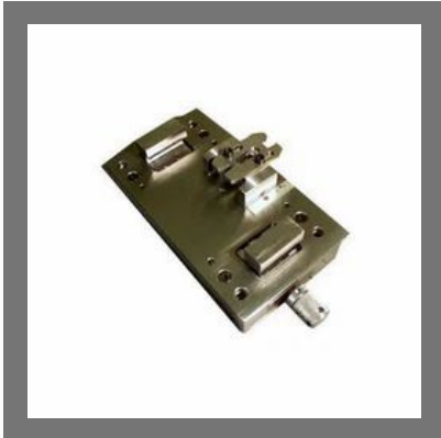
Jigs And Fixtures