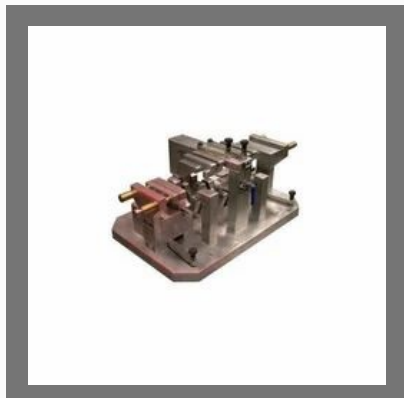
Industrial Jigs And Fixtures