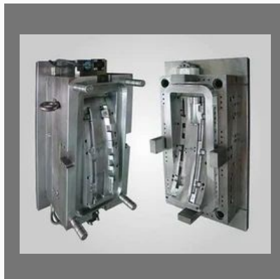
Plastic Injection Molds