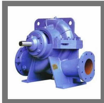
Water Pump Casing