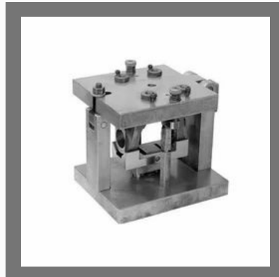
Automobile Jigs And Fixtures