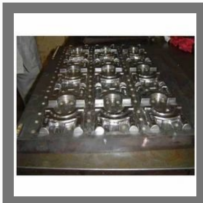
Foundry Tooling Corebox