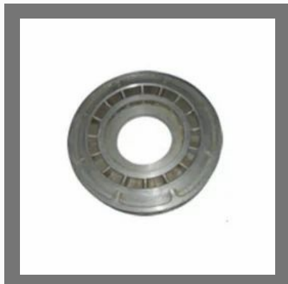
Aluminum Gravity Die Casting