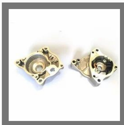
High Pressure Die Casting