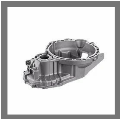
Motor Gear Casing