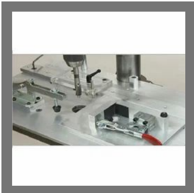
Metal Jigs And Fixtures