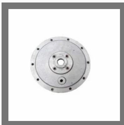
SS Gravity Die Casting