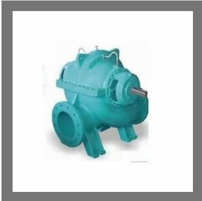
Water Pump Casing Casting