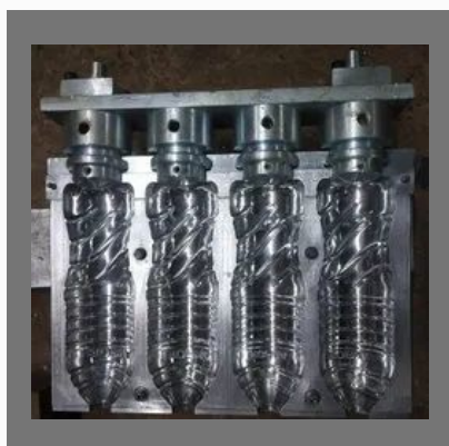
Plastic Water Bottle Mould 1 Ltr