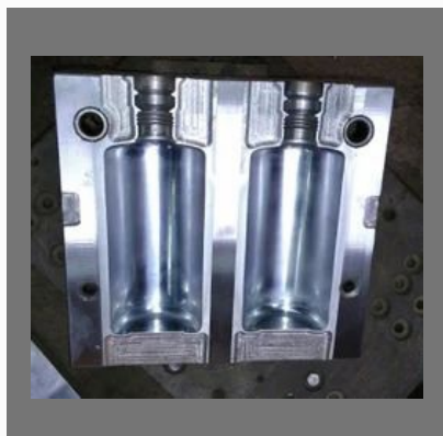
500ml HDPE Round Bottle Mould 2 Cavity