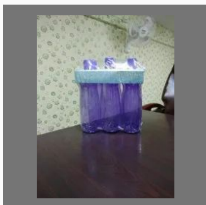
Plastic Water Bottle 1 Ltr