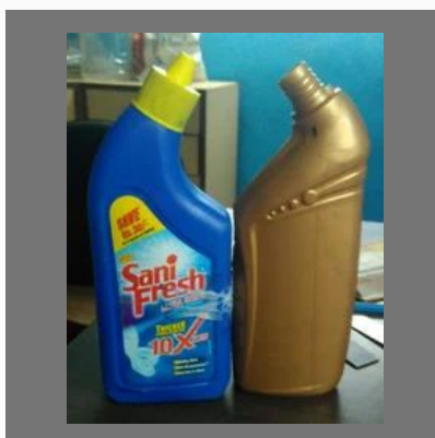
Toilet Cleaner Bottles