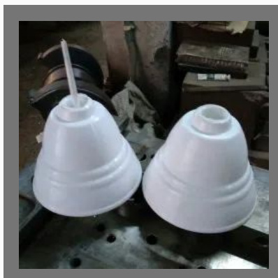
Fan Canopy Mould