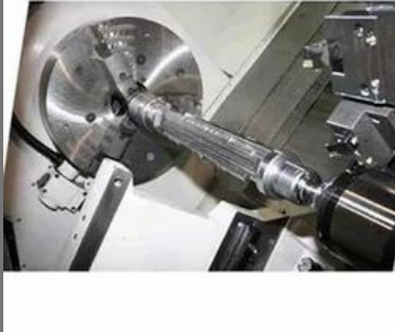
Industrial Conventional Turning Services