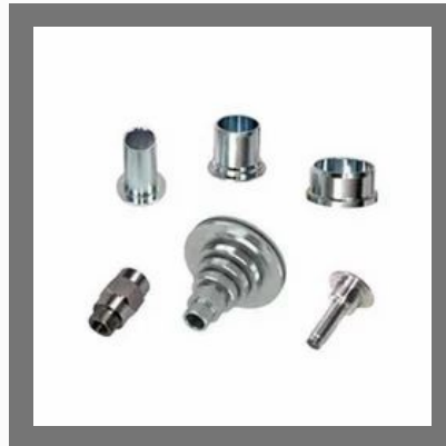
CNC Turned Parts