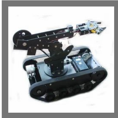
Industrial Customized Components