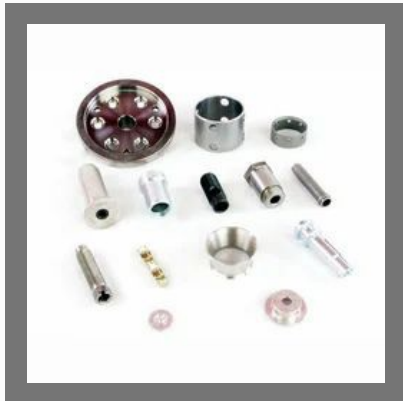
CNC Turned & Milled Components