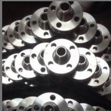
Alloy Steel Flanges