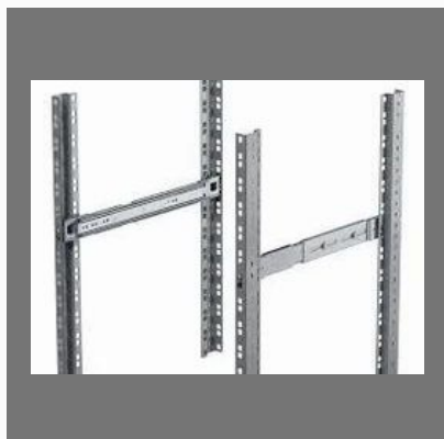
Ball Bearing Slides