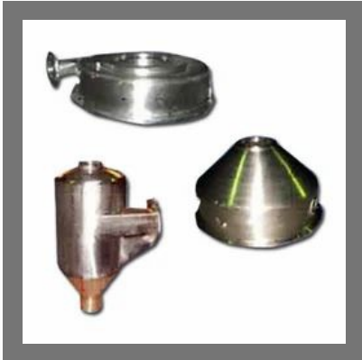
Metal Customized Components