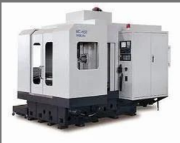
CNC Machining Centre